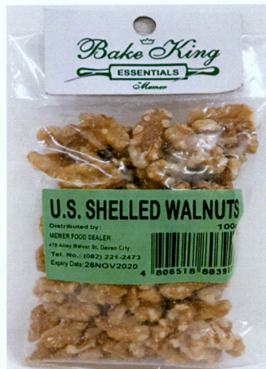
Figure 5. Unregistered BAKE KING ESSENTIALS U.S. Shelled Walnuts, Net Wt. 100g