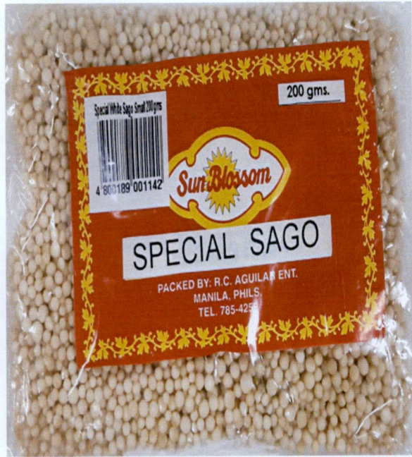
Figure 3. Unregistered SUN BLOSSOM Special Sago, Net Wt. 200g