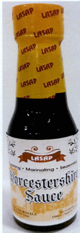
Figure 1. Unregistered LASAP Worcestershire Sauce, Net Content 150ml (Approx. 5 fl. oz.)

The Food and Drug Administration (FDA) warns the public from purchasing and consuming the following unregistered food products: