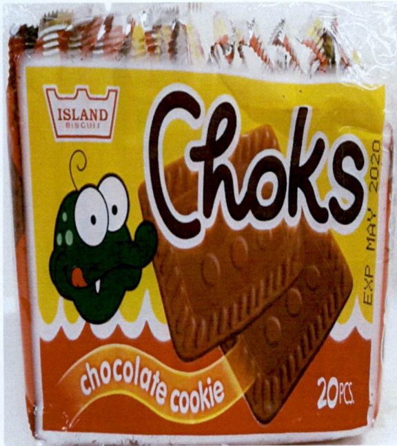
Figure 2. Unregistered ISLAND BISCUIT Choks Chocolate Cookie, Net Content. 20pcs