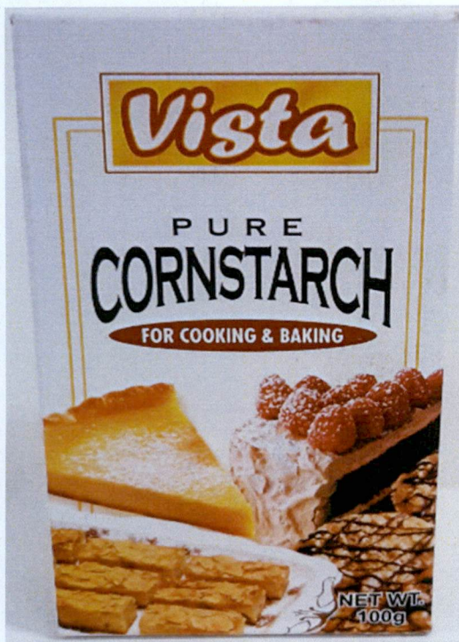
Figure 4. Unregistered VISTA Pure Cornstarch, Net Wt. 100g