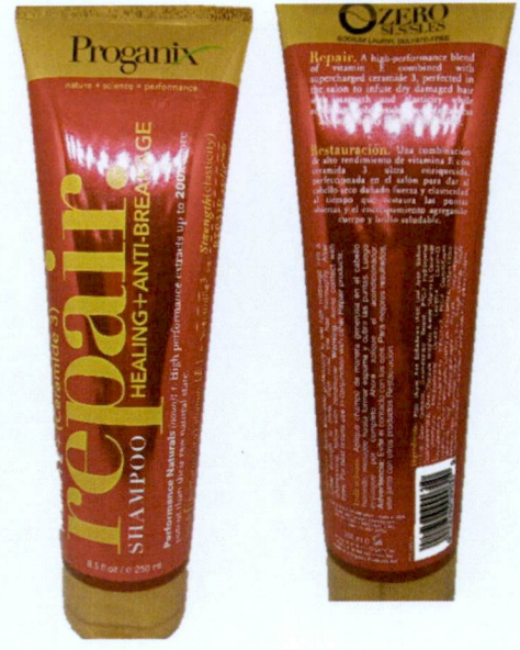
Figure 3. Unnotified Proganix Repair Shampoo Healing + Anti-Breakage