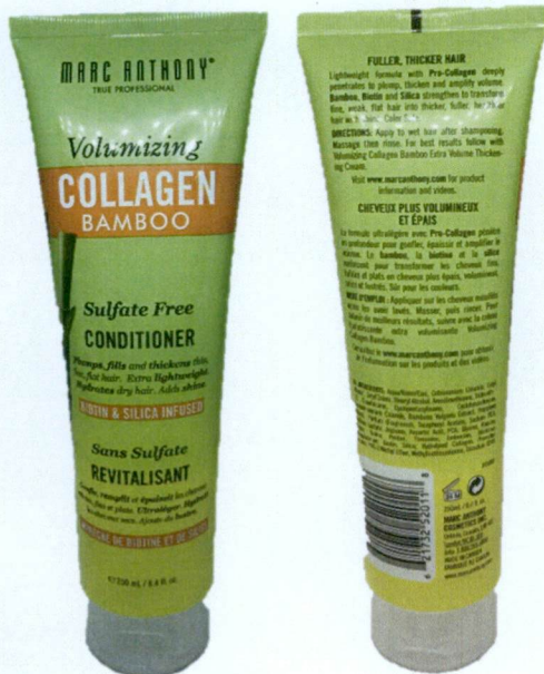
Figure 4. Unnotified Marc Anthony® Volumizing Collagen Bamboo Sulfate Free Conditioner