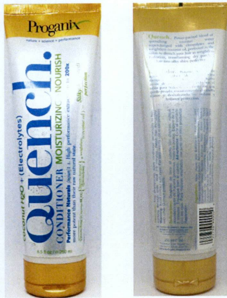
Figure 2. Unnotified Proganix Coconut H2O + (Electrolytes) Quench Conditioner Moisturizing + Nourish