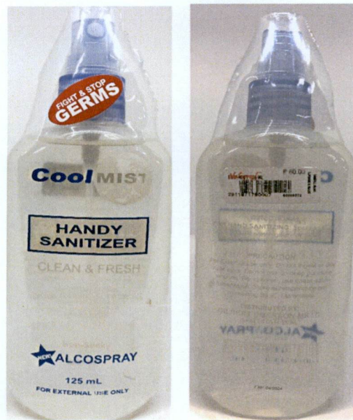
Figure 1. Unnotified Cool Mist Handy Sanitizer Clean & Fresh Alcospray

The Food and Drug Administration (FDA) warns the public from purchasing and using the following unnotified cosmetic products: