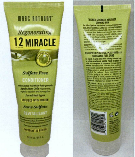
Figure 5. Unnotified Marc Anthony® Regenerating 12 Second Miracle Sulfate Free Conditioner