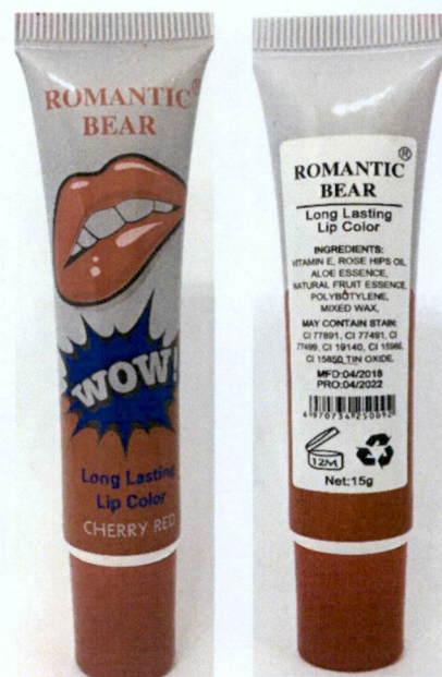
Figure 2. Unnotified Romantic Bear® Wow Long Lasting Lip Color Cherry Red