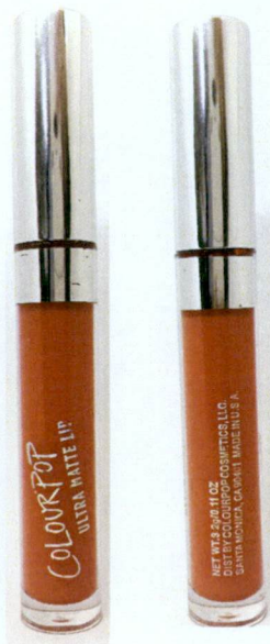
Figure 3. Unnotified Colourpop Ultra Matte Lip (Succulent)