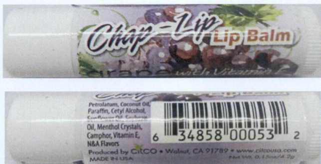
Figure 1. Unnotified Chap-Lip Lip Balm Grape with Vitamin E

The Food and Drug Administration (FDA) warns the public from purchasing and using the following unnotified cosmetic products: