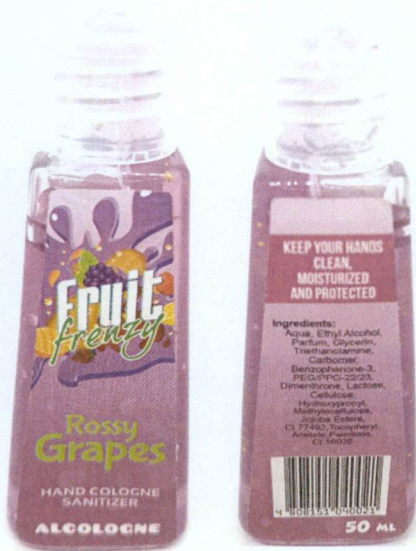
Figure 4. Unnotified Fruit Frenzy Rosy Grapes Hand Cologne Sanitizer Alcologne