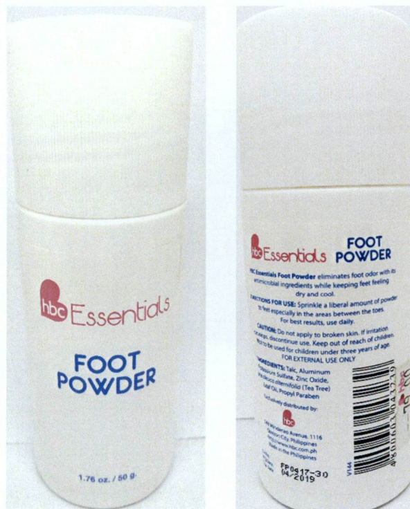
Figure 1. Unnotified HBC Essentials Foot Powder

The Food and Drug Administration (FDA) warns the public from purchasing and using the following unnotified cosmetic products: