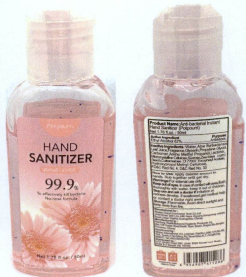
Figure 5. Unnotified Potpourri Hand Sanitizer 99.9%