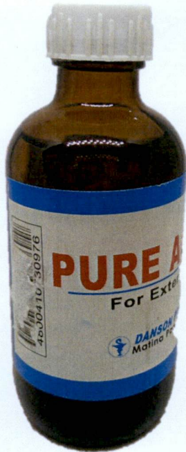
Figure 2. Unnotified Pure Acetone