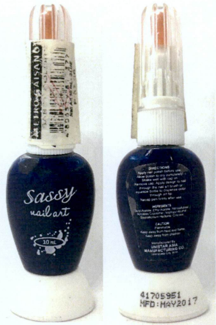
Figure 3. Unnotified Sassy Nail Art