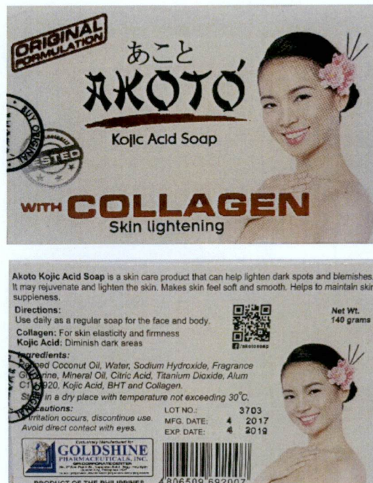
Figure 1. Unnotified Akoto Kojic Acid Soap with Collagen Skin Lightening

The Food and Drug Administration (FDA) warns the public from purchasing and using the following unnotified cosmetic products: