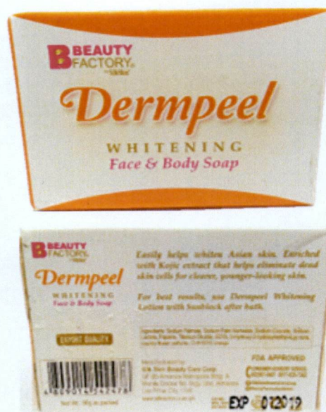
Figure 3. Unnotified Derm Peel Whitening Face & Body Soap

The FDA verified through post-marketing surveillance (PMS) that the abovementioned cosmetic products are not authorized and the Certificates of Product Notification have not been issued. Pursuant to Republic Act No. 9711, otherwise known as the “Food and Drug Administration Act of 2009”, the manufacture, importation, exportation, sale, offering for sale, distribution, transfer, non-consumer use, promotion, advertising or sponsorship of health products without the proper authorization from FDA is prohibited.