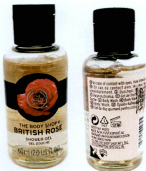
Figure 2. Unnotified The Body Shop® British Rose Shower Gel