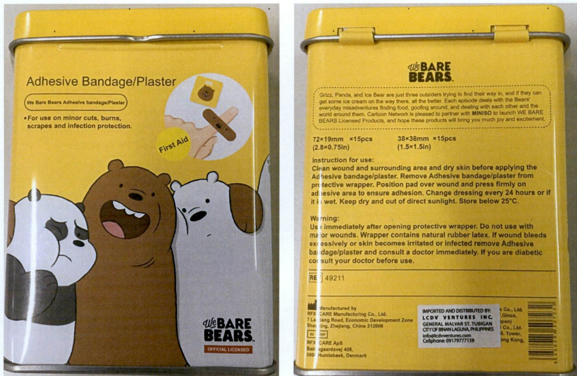
Figure 1. We Bare Bears Adhesive Bandage/Plaster

The Food and Drug Administration (FDA) warns the general public and all healthcare professionals against the purchase and use of the unregistered medical devices: