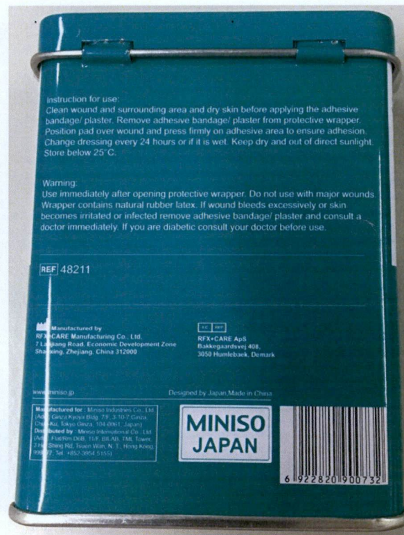
Figure 3. First Aid – Breathable & Waterproof Adhesive Bandage/Plaster (50 count)