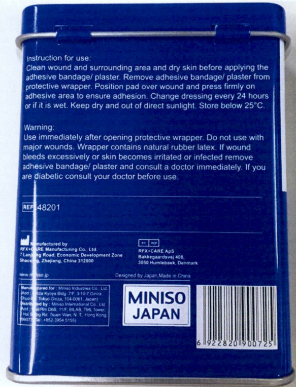
Figure 2. First Aid – Breathable & Waterproof Adhesive Bandage/Plaster (40 count)