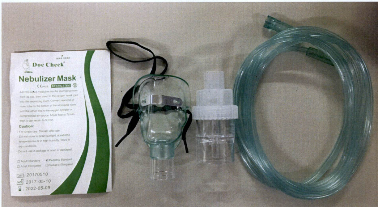
Figure 1. Unregistered Doc Check® – Nebulizer Mask

The Food and Drug Administration (FDA) warns all healthcare professionals and the general public against the purchase and use of the unregistered medical device: