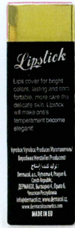
Figure 5. Unnotified Dermacol Lipstick (Velvet Repair Embellish, No. D10)