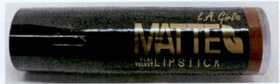
Figure 3. Unnotified L.A. Girl® Matte Flat Velvet Lipstick