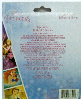
Figure 4. Unnotified Disney Princess Lipgloss