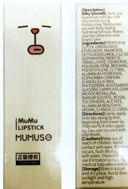
Figure 1. Unnotified Mumuso Mumu Lipstick Smooth and Lasting Lipstick (Rose Red)

The Food and Drug Administration (FDA) warns the public from purchasing and using the following unnotified cosmetic products: