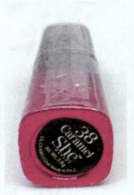
Figure 2. Unnotified She™ Makeup Lipstick (Caramel 38)