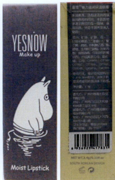
Figure 2. Unnotified Yesnow Makeup Moist Lipstick