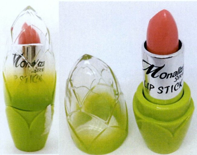
Figure 1. Unnotified Monaliza Series Lipstick

The Food and Drug Administration (FDA) warns the public from purchasing and using the following unnotified cosmetic products: