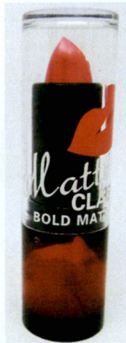
Figure 3. Unnotified Matte Clareal Bold Matte Lipstick 2