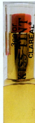
Figure 4. Unnotified 3Color Kiss Tint Clareal® (Clareal 5)

The FDA verified through post-marketing surveillance (PMS) that the abovementioned cosmetic products are not authorized and the Certificates of Product Notification have not been issued. Pursuant to Republic Act No. 9711, otherwise known as the “Food and Drug Administration Act of 2009”, the manufacture, importation, exportation, sale, offering for sale, distribution, transfer, non-consumer use, promotion, advertising or sponsorship of health products without the proper authorization from FDA is prohibited.