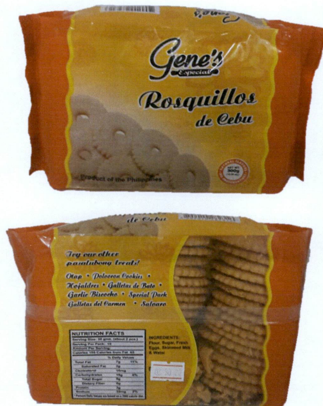
Figure 1. Unregistered GENE'S ESPECIAL Rosquillos de Cebu

The Food and Drug Administration (FDA) warns the public from purchasing and consumption of the following unregistered food products: