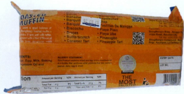
Figure 2. Unregistered BONGBONG'S® Toasted Muffin Bacolod's Finest Delicacies