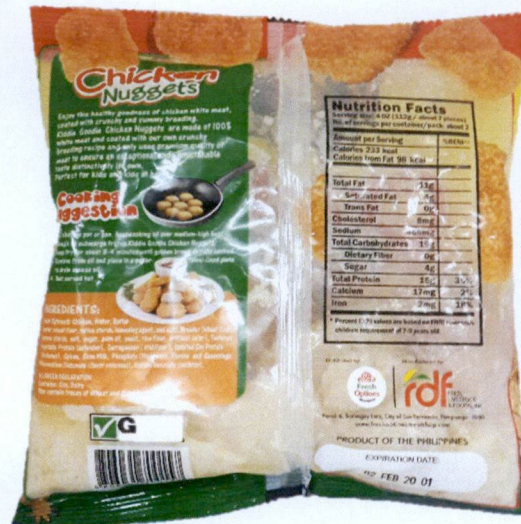
Figure 5. Unregistered KIDDIE GOODIE Chicken Nuggets