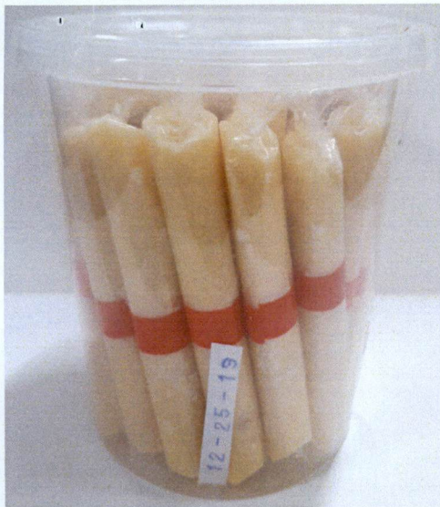
Figure 2. (UNBRANDED) Unregistered ROLL PASTILLAS