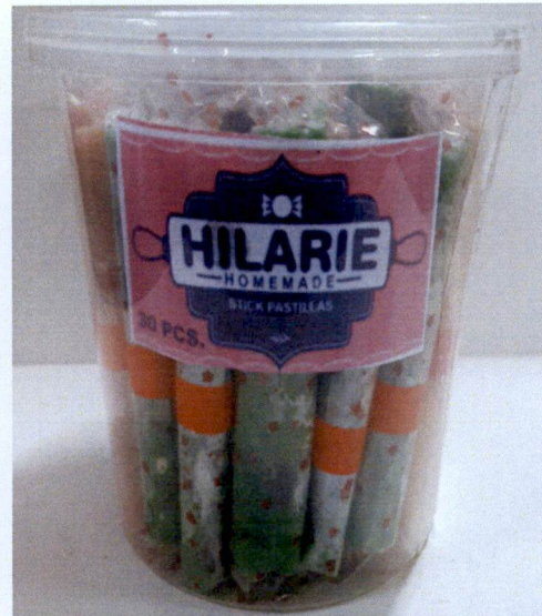
Figure 3. Unregistered HILARIE HOMEMADE Stick Pastillas, 30 pcs