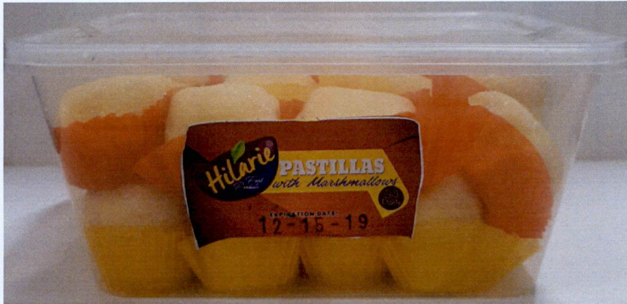
Figure 4. Unregistered HILARIE FOOD PRODUCTS Pastillas with Marshmallows, 24pcs