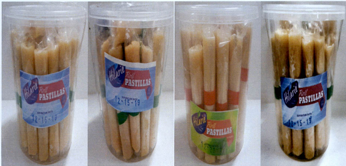
Figure 1. Unregistered HILARIE FOOD PRODUCTS Roll Pastillas, 31pcs

The Food and Drug Administration (FDA) warns the public from purchasing and consuming the following unregistered food products: