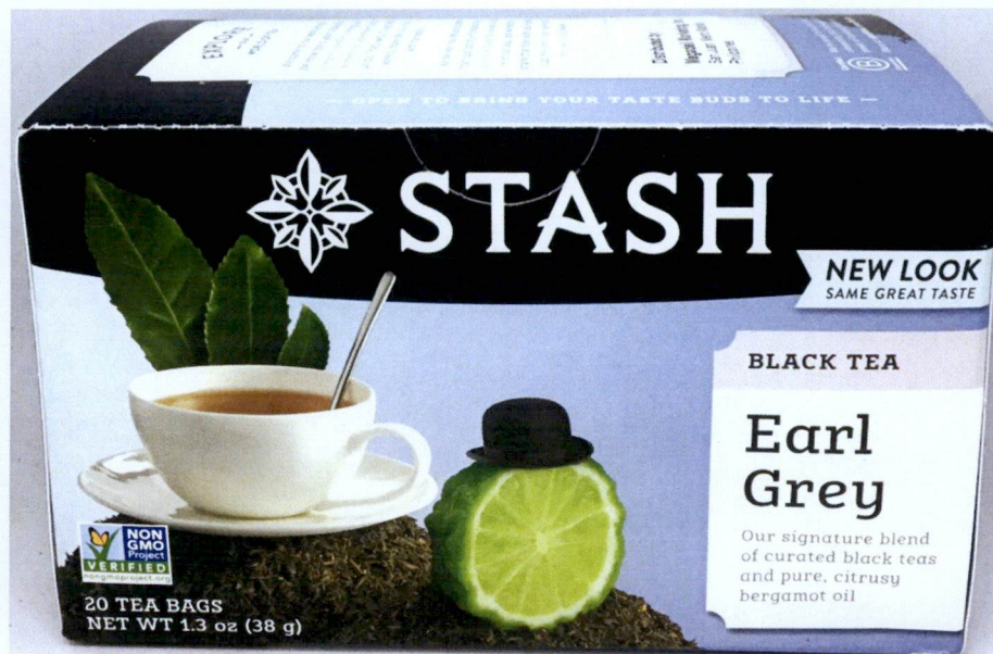
Figure 1. Unregistered STASH Black Tea Earl Grey 38g

The Food and Drug Administration (FDA) warns the public from purchasing and consuming the following unregistered food products and food supplements: