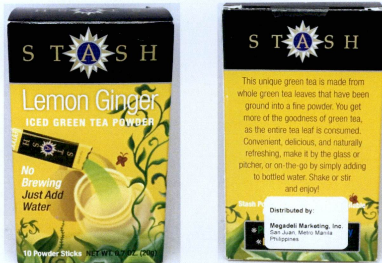
Figure 2. Unregistered STASH Lemon Ginger Iced Green Tea Powder 20g