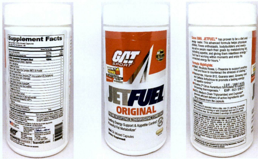
Figure 4. Unregistered GAT SPORT JETFUEL Original Dietary Supplement Capsules