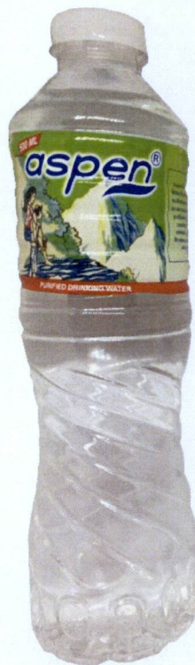
Figure 5. Unregistered ASPEN Purified Drinking Water

The FDA verified through post-marketing surveillance that the abovementioned food products and food supplements are not authorized and the Certificates of Product Registration have not been issued. Pursuant to the Republic Act No. 9711, otherwise known as the “Food and Drug Administration Act of 2009”, the manufacture, importation, exportation, sale, offering for sale, distribution, transfer, non-consumer use, promotion, advertising or sponsorship of health products without the proper authorization is prohibited.