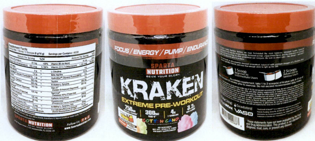
Figure 3. Unregistered SPARTA NUTRITION KRAKEN Extreme Pre-Workout Cotton Candy Flavoured Dietary Supplement