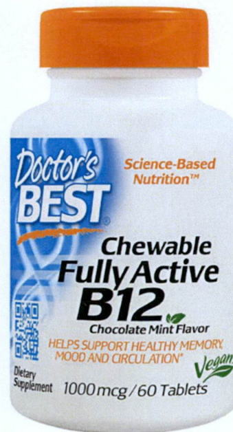
Figure 5. Unregistered DOCTOR'S BEST Chewable Fully Active B12 Chocolate Mint Flavor Dietary Supplement

The FDA verified through post-marketing surveillance that the abovementioned food supplements are not registered and the Certificate of Product Registration (CPR) have not yet been issued. Pursuant to the Republic Act No. 9711, otherwise known as the "Food and Drug Administration Act of 2009", the manufacture, importation, exportation, sale, offering for sale, distribution, transfer, non-consumer use, promotion, advertising or sponsorship of health products without the proper authorization is prohibited.