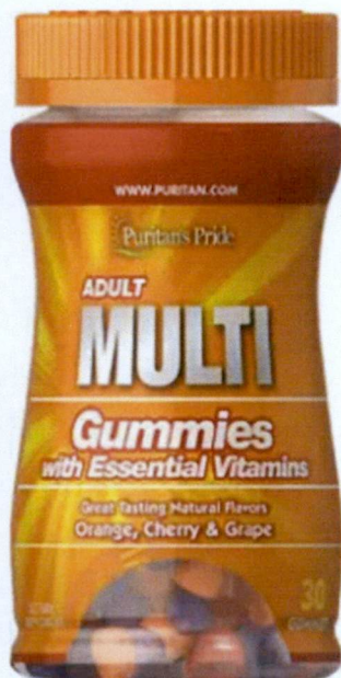
Figure 4. Unregistered PURITAN'S PRIDE Multivitamin Gummies with Essential Vitamins Orange, Cherry & Grape (Adult) Dietary Supplement