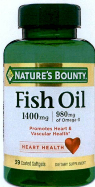
Figure 1. Unregistered NATURE'S BOUNTY Fish Oil Promotes Heart & Vascular Health Heart Health Dietary Supplement

The Food and Drug Administration (FDA) warns the public from purchasing and consumption of the following unregistered food supplements: