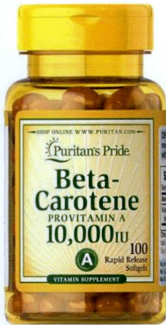
Figure 2. Unregistered PURITAN'S PRIDE Beta-Carotene Provitamin A 10000 IU Vitamin Supplement