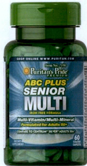
Figure 3. Unregistered PURITAN'S PRIDE ABC Plus Senior Multi Dietary Supplement