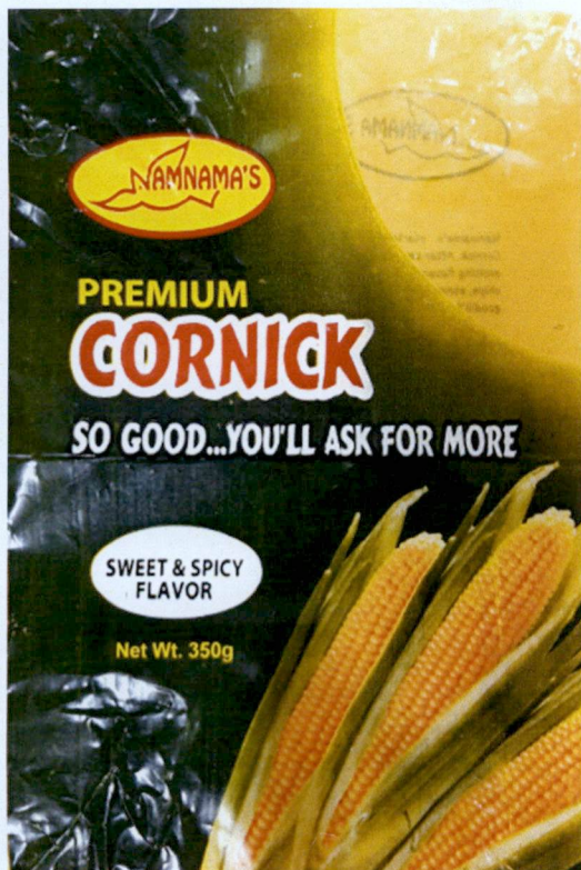
Figure 4. Unregistered NAMNAMA'S Premium Cornick Sweet & Spicy Flavor, Net Wt. 350g