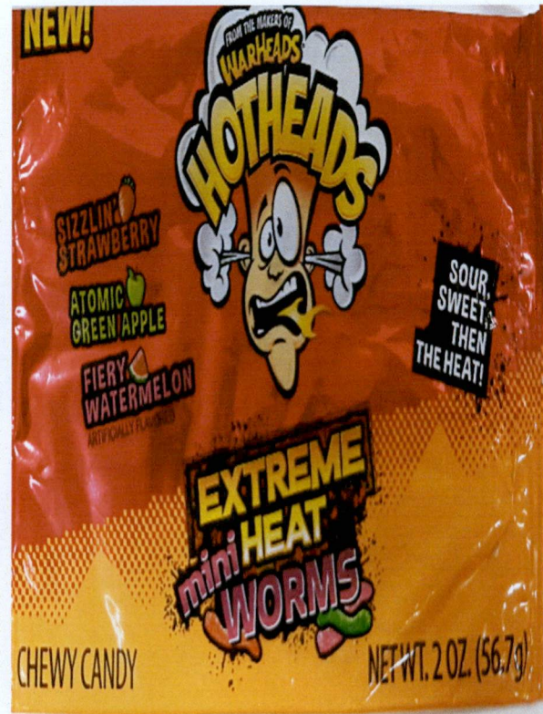
Figure 5. Unregistered WARHEADS HOTHEADS Extreme Mini Heat Worms Chewy Candy (Sizzling Strawberry, Atomic Green Apple, Fiery Watermelon), Net Wt. 2oz (56.7g)