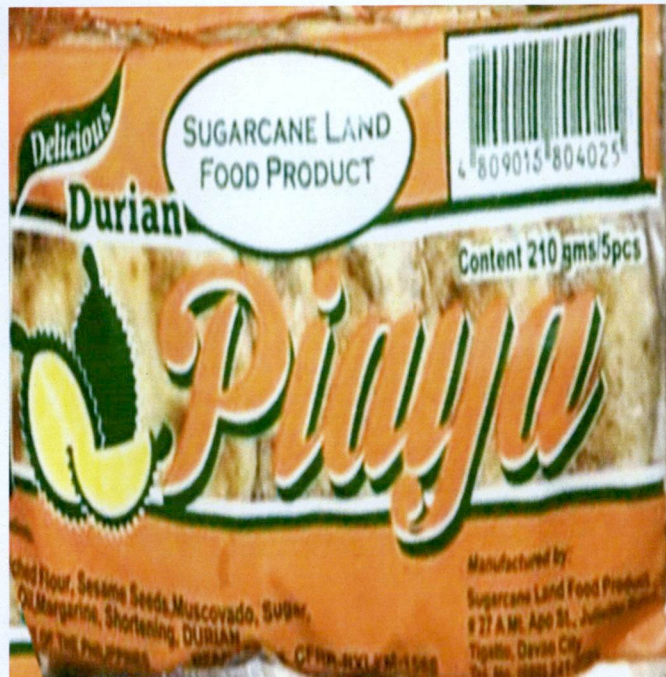
Figure 3. Unregistered SUGARCANE LAND FOOD PRODUCT Piaya – Durian, Net Content: 210gms/5pcs