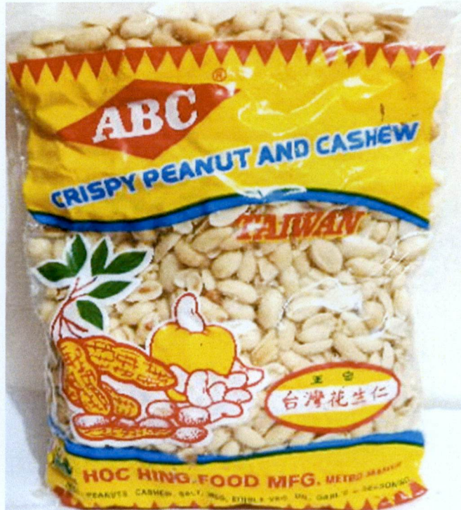
Figure 1. Unregistered ABC Crispy Peanut and Cashew

The Food and Drug Administration (FDA) warns the public from purchasing and consuming the following unregistered food products: