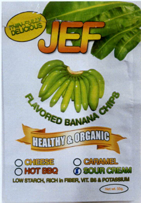
Figure 2. Unregistered JEF Flavored Banana Chips – Sour Cream, Net Wt. 55g