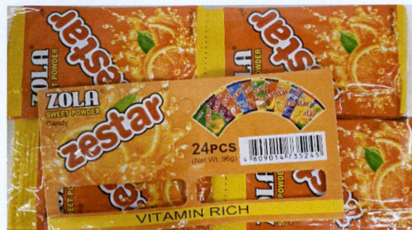
Figure 5. Unregistered ZESTAR Zola Sweet Powder Candy – Orange Flavour, Net Wt. 4g (24pcs)