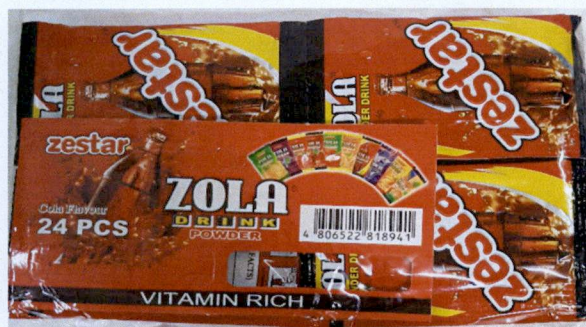
Figure 4. Unregistered ZESTAR Zola Drink Powder – Cola Flavour, Net Wt. 4g (24pcs)