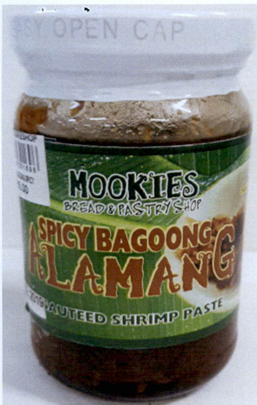
Figure 2. Unregistered MOOKIES BREAD & PASTRY SHOP Spicy Bagoong Alamang Sautéed Shrimp Paste