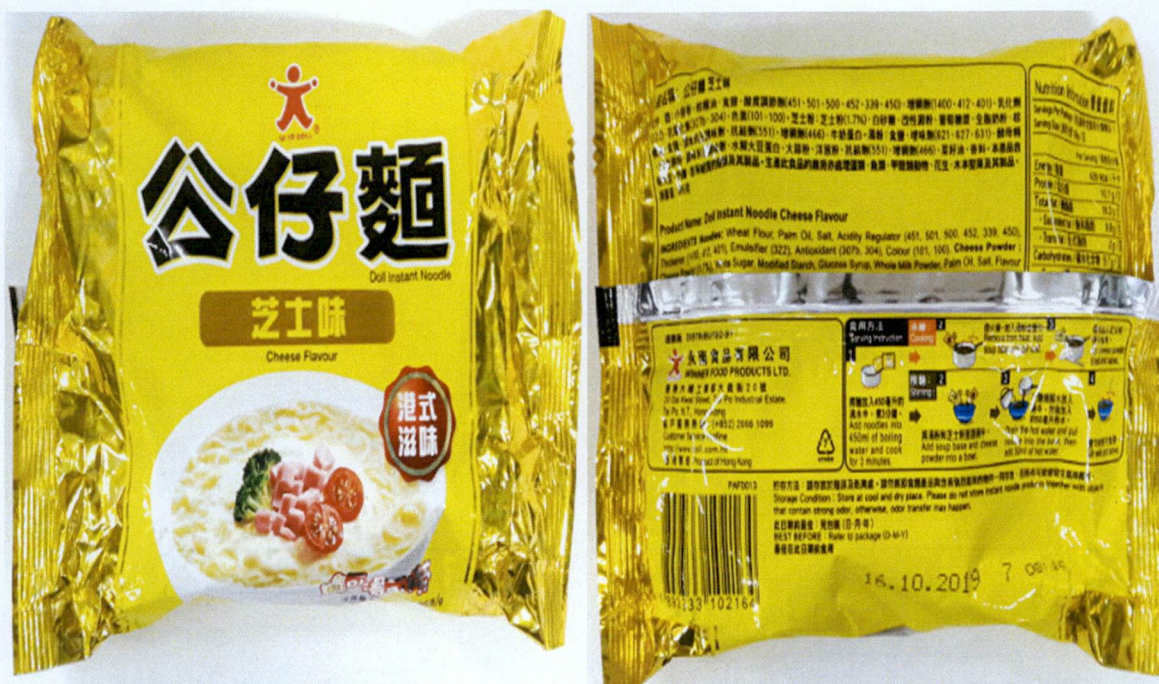
Figure 3. Unregistered DOLL INSTANT NOODLE Cheese Flavour, Net Wt. 95g

The Food and Drug Administration (FDA) warns the public from purchasing and consuming the following unregistered food products: