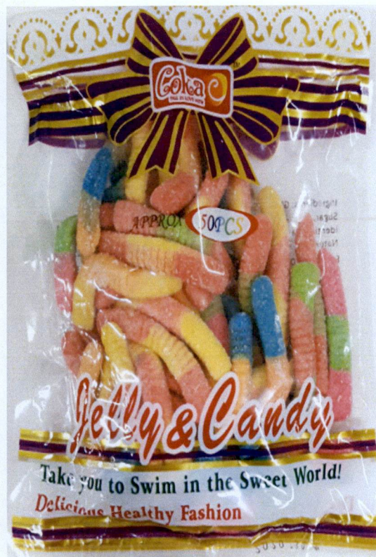
Figure 3. Unregistered COKA FALL IN LOVE WITH Jelly & Candy, Approx. 50pcs