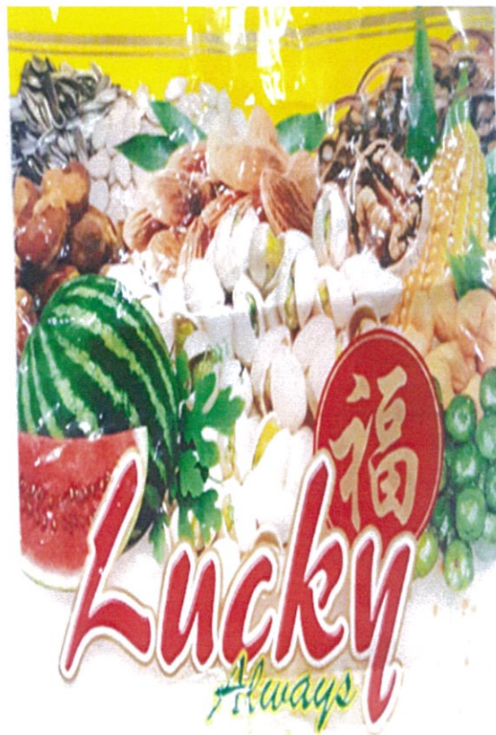
Figure 4. Unregistered LUCKY ALWAYS