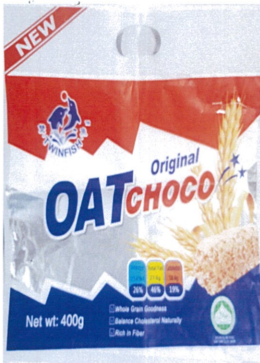
Figure 2. Unregistered TWINFISH Original Oatchoco, Net Wt. 400g