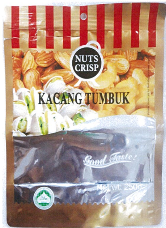
Figure 3. Unregistered NUTS CRISP Kacang Tumbuk, Net Wt. 250g