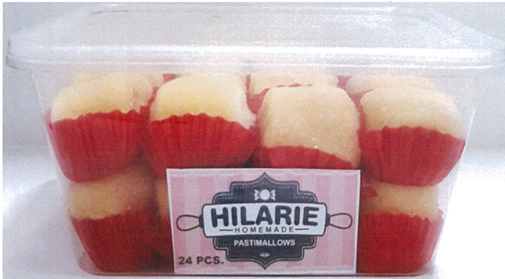
Figure 1. Unregistered Hilarie Homemade PastimalloWS, 24 pcs.

The Food and Drug Administration (FDA) warns the public from purchasing and consuming the following unregistered food products: