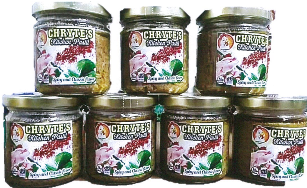
Figure 3. Unregistered CHRYTE'S Kitchen Pastil – Spicy and Classic Flavor