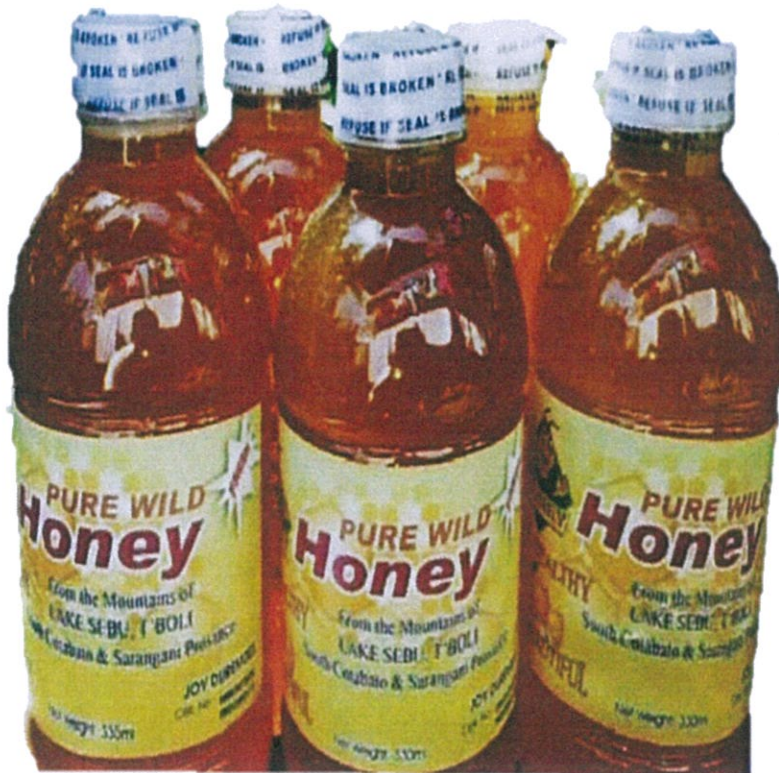
Figure 4. Unregistered PURE WILD HONEY From the Mountains of Lake Sebu, T'Boi