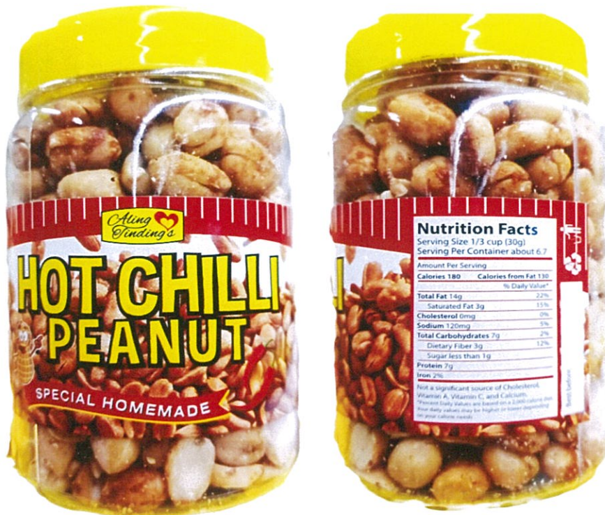
Figure 1. Unregistered ALING TINDING'S Hot Chilli Peanut

The Food and Drug Administration (FDA) warns the public from purchasing and consuming the following unregistered food products: