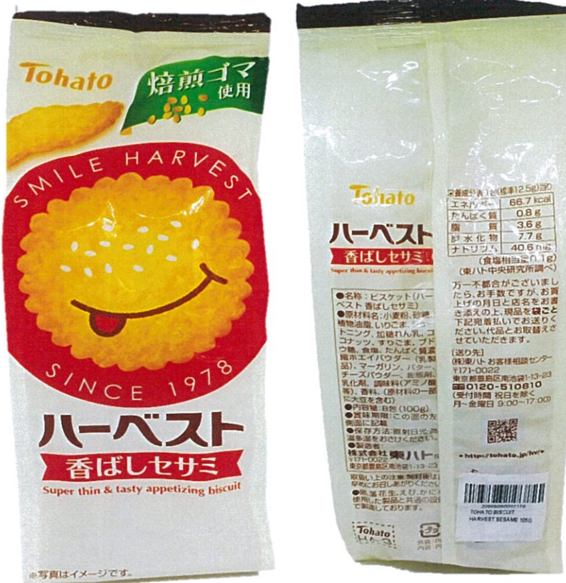
Figure 5. Unregistered TOHATO Smile Harvest Sesame Biscuit