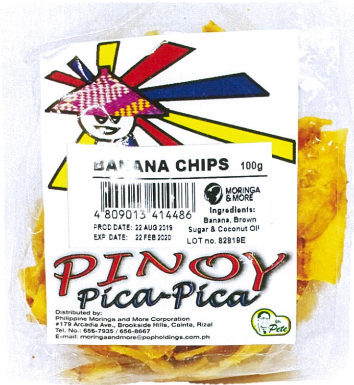
Figure 2. Unregistered PINOY PICA-PICA Banana Chips