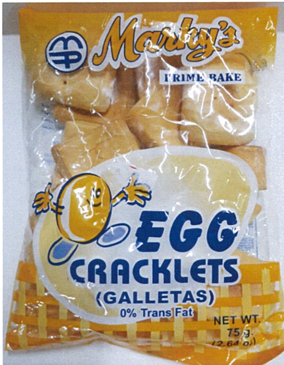
Figure 2. Unregistered MARKY'S Prime Bake Egg Cracklets (Galletas), Net Wt. 75g