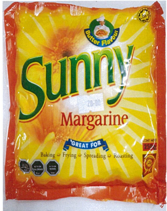
Figure 3. Unregistered SUNNY Margarine Butter Flavor, Net Content 250g