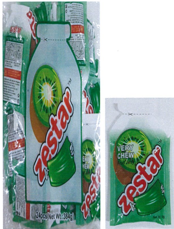
Figure 5. Unregistered ZESTAR Very Chew Fruit Jelly (Kiwi), Net Wt. 384g (24pc)