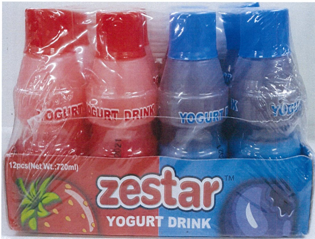
Figure 3. Unregistered ZESTAR Yogurt Drink, Net Wt. 720ml) 12pcs.

The Food and Drug Administration (FDA) warns the public from purchasing and consuming the following unregistered food products: