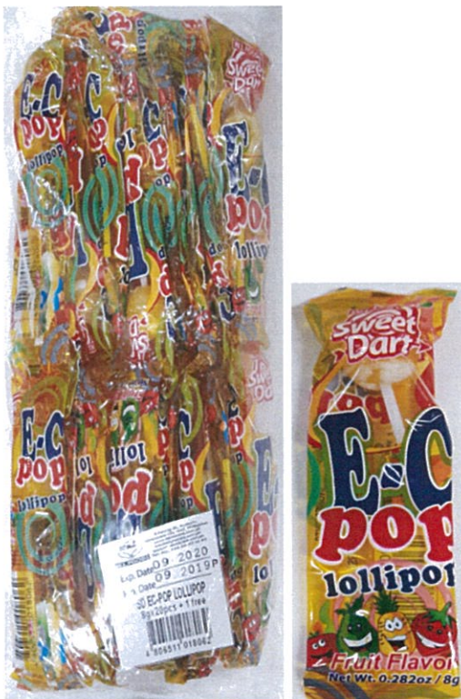
Figure 4. Unregistered E-C POP Lollipop, Net Wt. 8g X 20pcs + 1