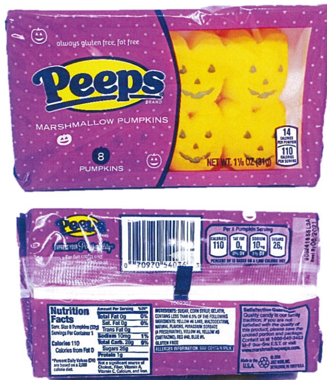
Figure 3. Unregistered PEEPS BRAND Marshmallow Pumpkins