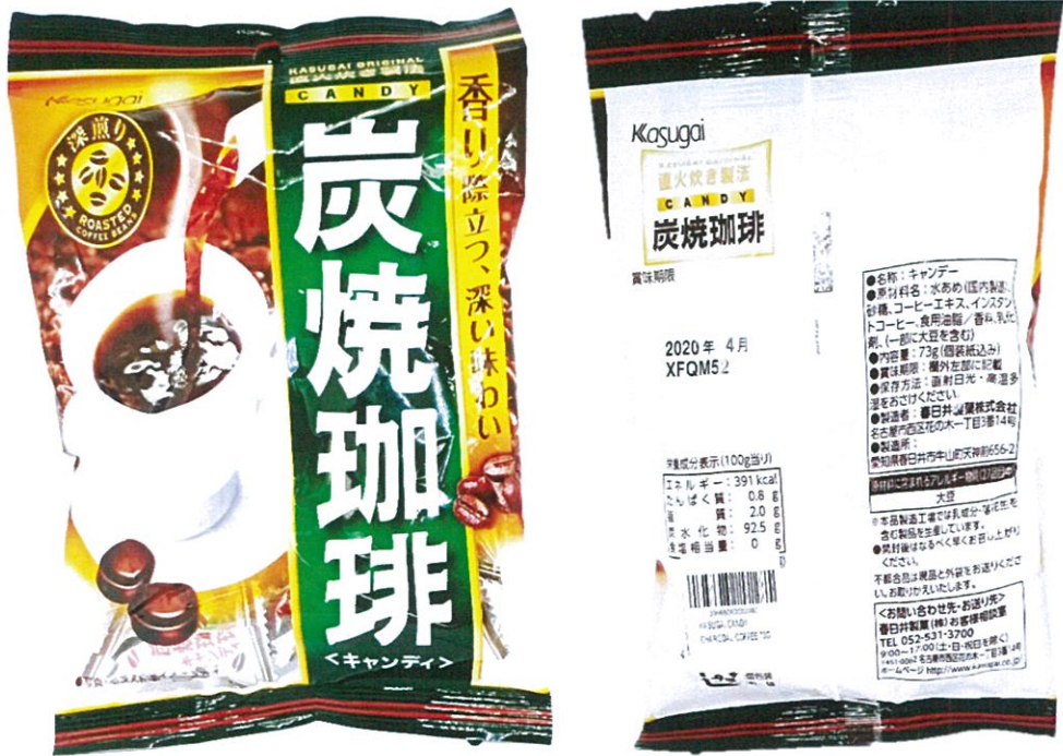
Figure 2. Unregistered KASUGAI Roasted Coffee Beans – Original Candy