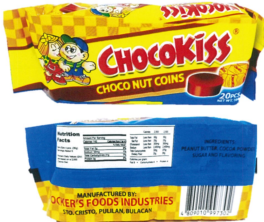
Figure 1. Unregistered CHOCOKISS Choco Nut Coins

The Food and Drug Administration (FDA) warns the public from purchasing and consuming the following unregistered food products: