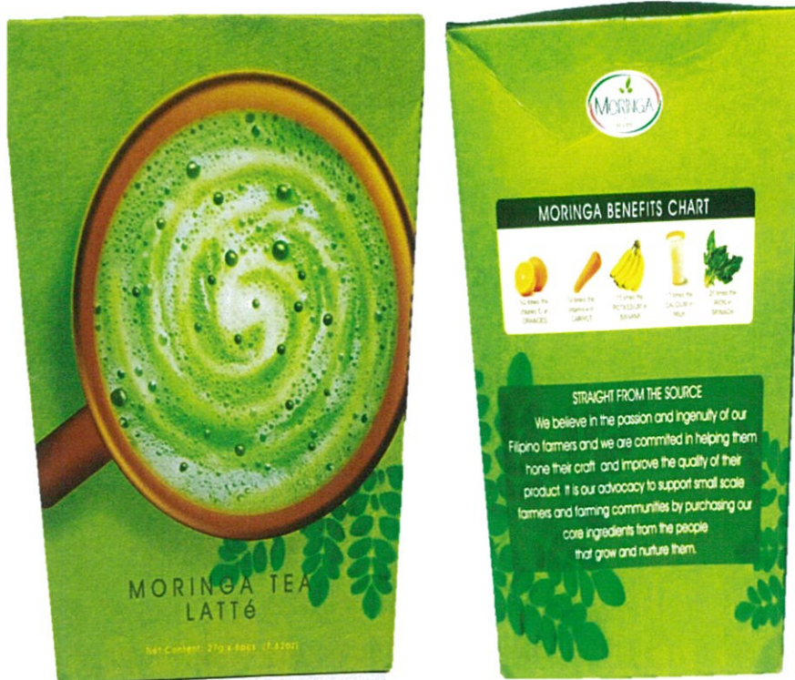
Figure 4. Unregistered MORINGA & MORE Moringa Tea Latte