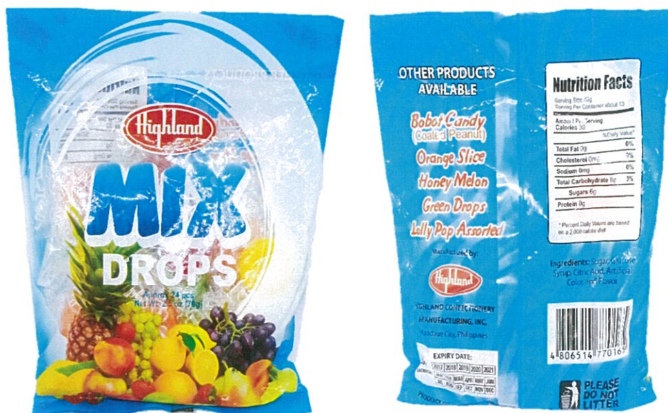
Figure 5. Unregistered HIGHLAND Mix Drops