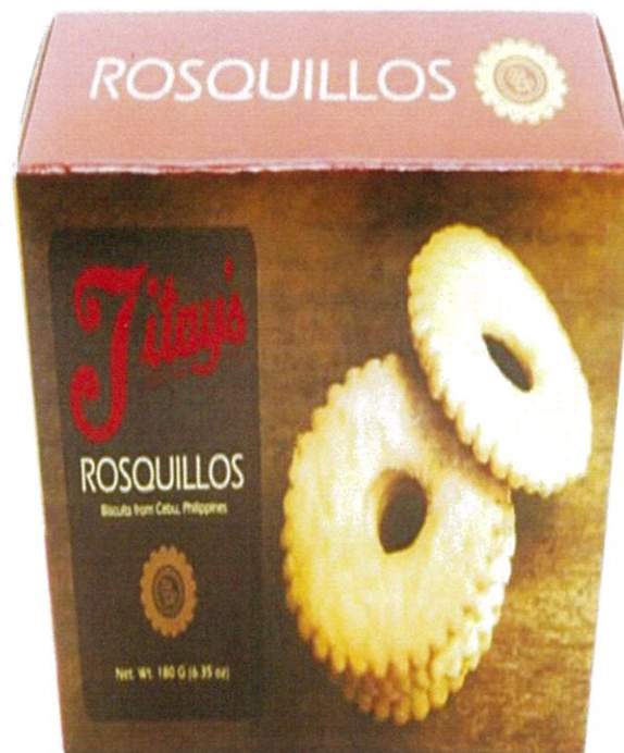
Figure 1. Principal Display Panel of the Approved label of TITAY'S FOOD PRODUCTS Rosquillos Food Product with registration number FR-141202 valid until 06 October 2021.

The Food and Drug Administration (FDA) informs the public that the food product TITAY'S FOOD PRODUCTS Rosquillos is registered by the Market Authorization Holder, Titay's Lilo-an Rosquillos & Delicacies, Inc. , in accordance to existing FDA rules and regulations.