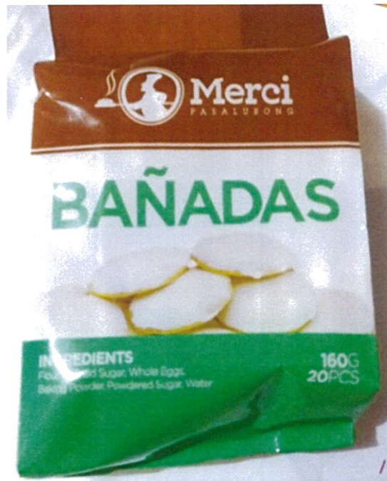
Figure 3. Unregistered MERCI Bañadas, 20pcs.