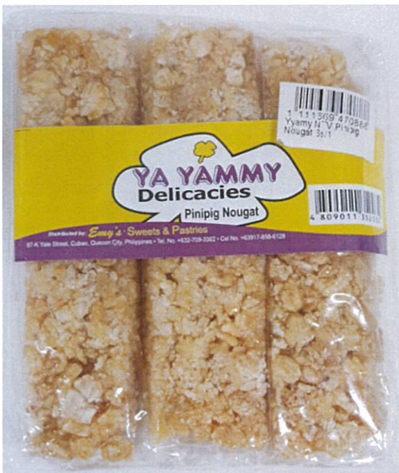
Figure 4. Unregistered YA YAMMY DELICACIES Pinipig Nougat,