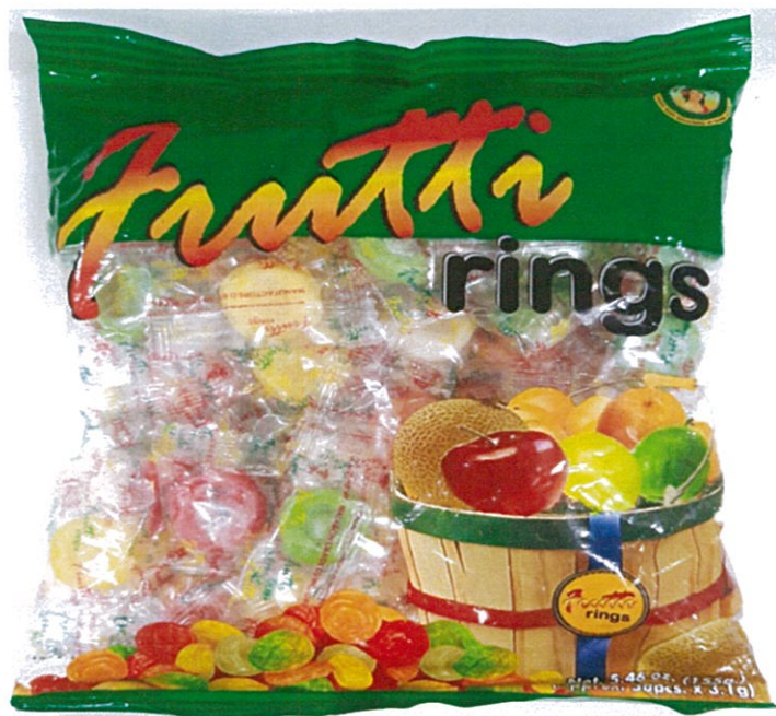
Figure 1. Unregistered FRUTTI Rings, Net Wt. 5.46oz (155g) (Approx. 50pcs x 3.1g)

The Food and Drug Administration (FDA) warns the public from purchasing and consuming the following unregistered food products: