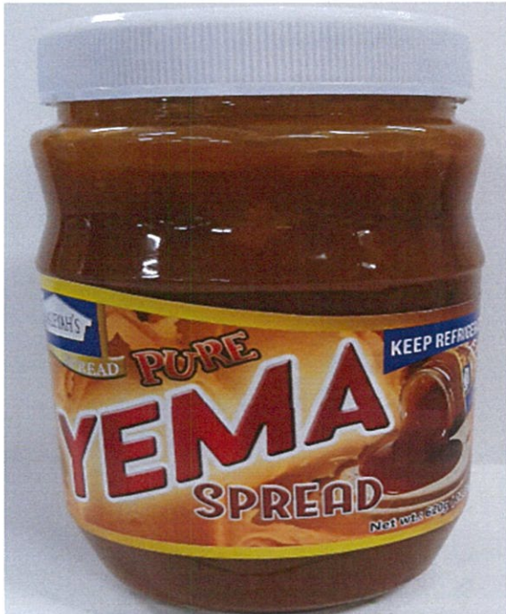
Figure 2. Unregistered AALEYAH'S SPREAD Pure Yema Spread, Net Wt. 620g (21.8699oz)