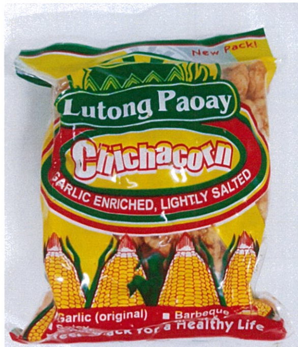
Figure 5. Unregistered LUTONG PAOAY Chichacorn Garlic Enriched Lightly Salted-Cheese, Net Wt. 3.574oz (100 grams)