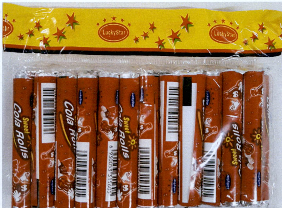
Figure 1. Unregistered LUCKYSTAR Sweet Cola Rolls

The Food and Drug Administration (FDA) warns the public from purchasing and consuming the following unregistered food products: