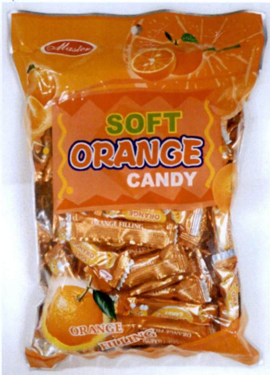
Figure 2. Unregistered MASTER Soft Orange Candy – Orange Filling, Net Content 60pcs