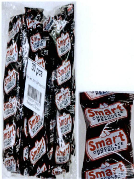
Figure 4. Unregistered SMART Chocolate Peanuts, 30pcs