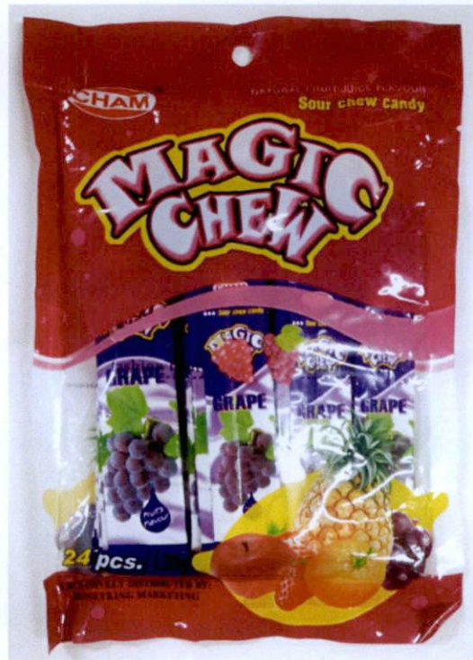
Figure 3. Unregistered CHAM Magic Chew Sour Chew Candy – Grape Flavor, Net Wt. 120g (24pcs.)