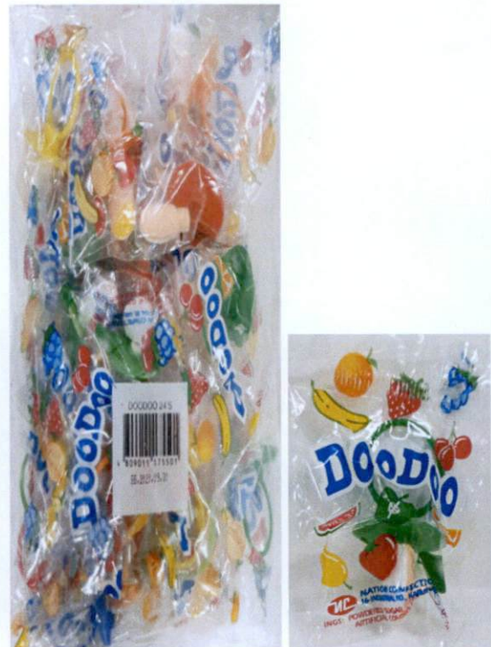
Figure 5. Unregistered DOODOO