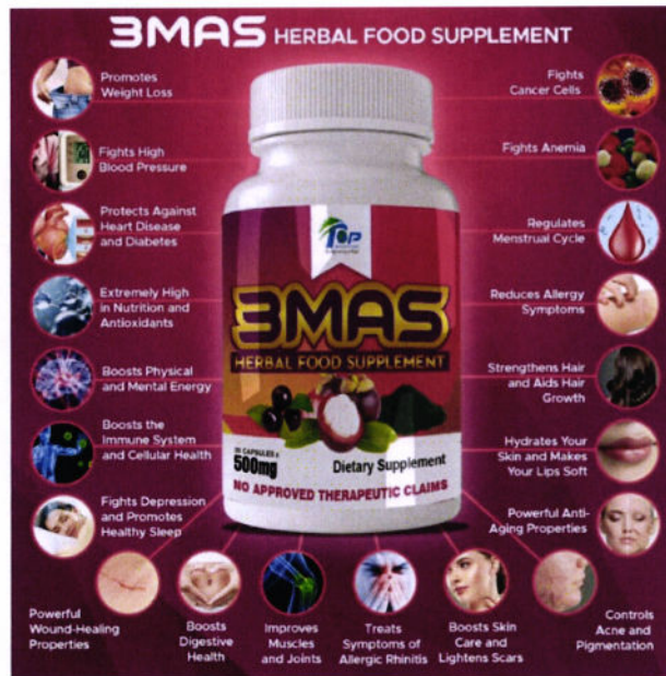
Figure 4. Unregistered TOP ENTERPRISES 3mas Herbal Food Supplement