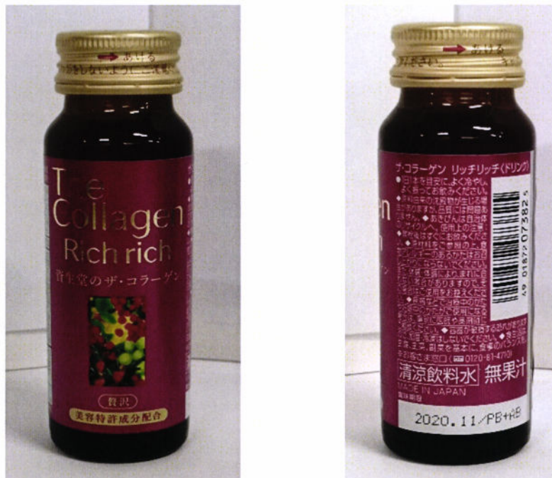
Figure 1. Unregistered The Collagen Rich Rich

The Food and Drug Administration (FDA) advises the public from purchasing and consuming the following unregistered food supplements: