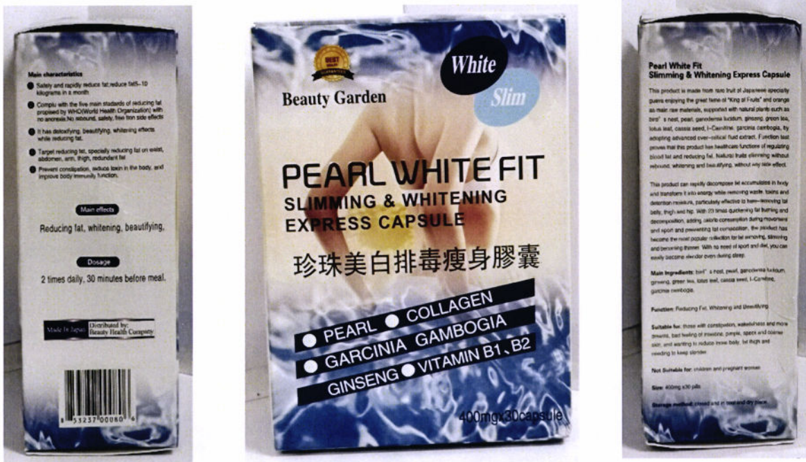
Figure 3. Unregistered BEAUTY GARDEN PEARL WHITE FIT Slimming and Whitening Express Capsule