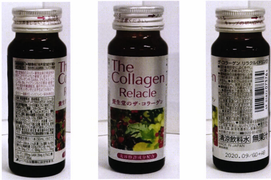
Figure 2. Unregistered The Collagen Relace