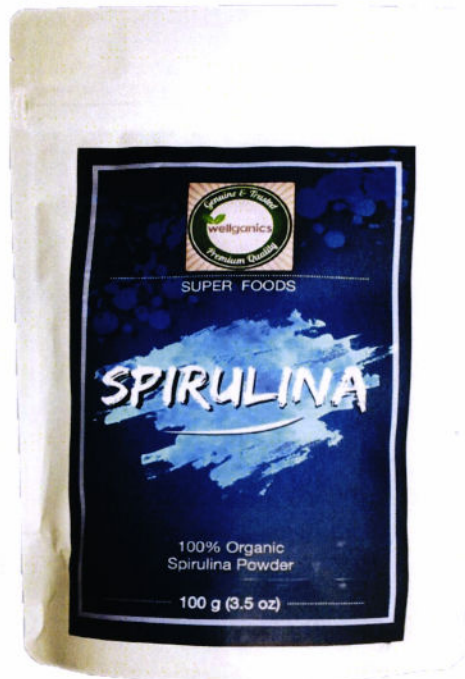
Figure 1. Unregistered WELLGANICS “Live Well, Live Free” Spirulina Powder 100g

The Food and Drug Administration (FDA) warns the public from purchasing and consuming the following unregistered food products: