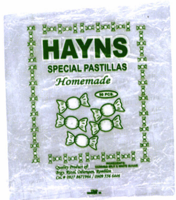
Figure 5. Unregistered HAYNS Special Pastillas, Homemade, 50pcs