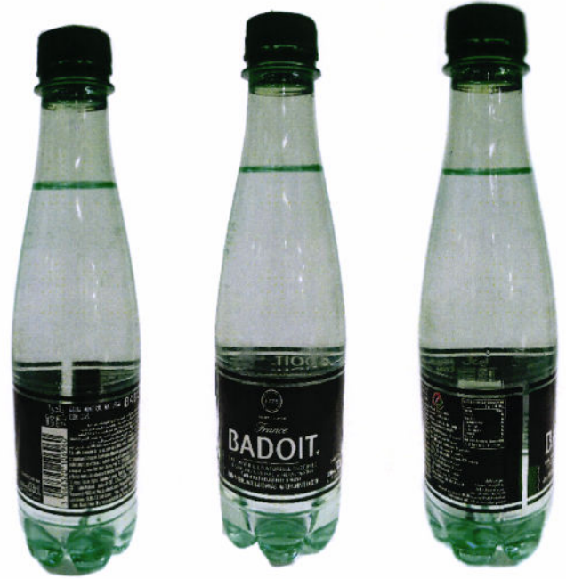
Figure 3. Unregistered 1778 Saint Galmier France Badoit Sparkling Natural Mineral Water, 330ml