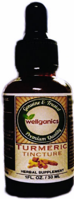
Figure 2. Unregistered WELLGANICS “Live Well, Live Free” Turmeric Tincture, 30ml