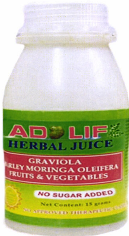
Figure 4. Unregistered AD LIF Herbal Juice, Graviola Barley, Moringa Oleifera Fruits and Vegetables