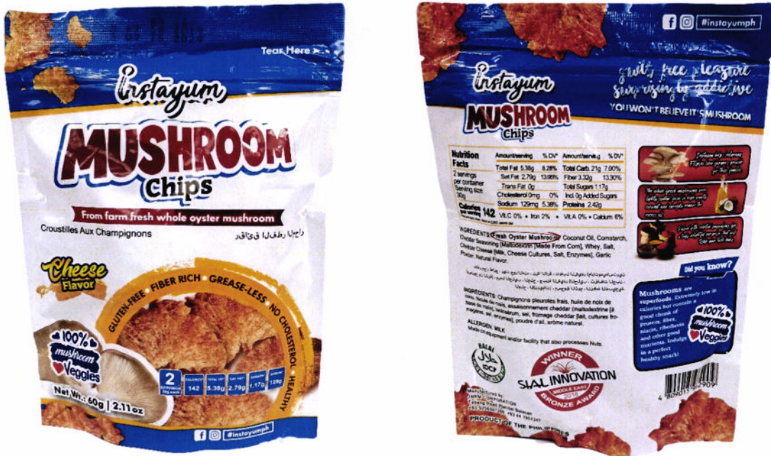
Figure 2. Unregistered INSTAYUM Mushroom Chips, Cheese Flavor