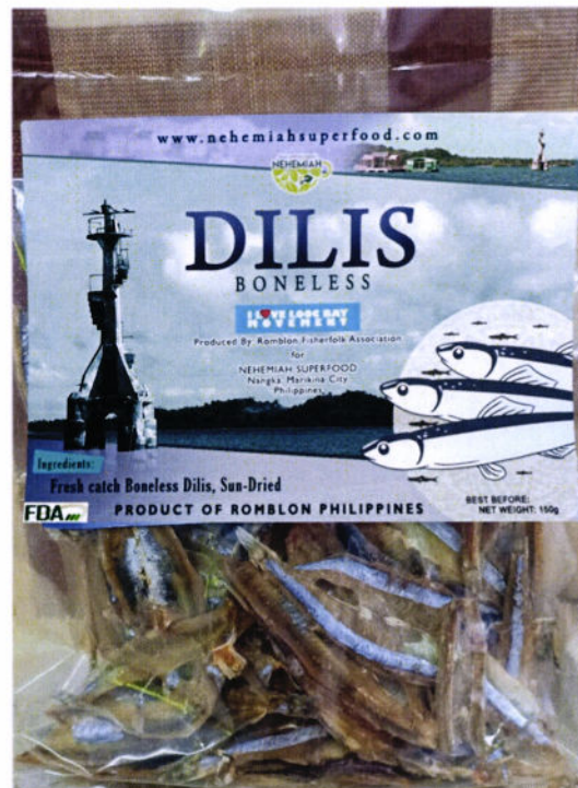
Figure 1. Unregistered NEHEMIAH SUPERFOOD Boneless Dilis

The Food and Drug Administration (FDA) advises the public from purchasing and consuming the following unregistered food products: