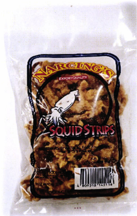
Figure 3. Unregistered NARCING'S Squid Strips