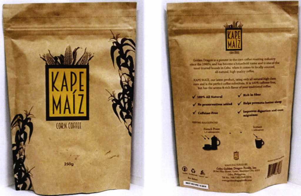
Figure 4. Unregistered KAPE MAIZ Corn Coffee

The FDA verified through post-marketing surveillance that the abovementioned food products are not authorized and the Certificates of Product Registration (CPR) have not been issued. Pursuant to the Republic Act No. 9711, otherwise known as the “Food and Drug Administration Act of 2009”, the manufacture, importation, exportation, sale, offering for sale, distribution, transfer, non-consumer use, promotion, advertising or sponsorship of health products without the proper authorization is prohibited.