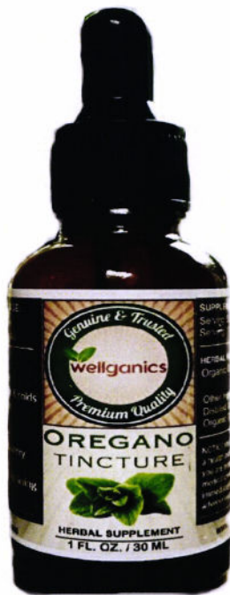
Figure 4. Unregistered WELLGANICS “Live Well, Live Free” Oregano Tincture, Herbal Supplement 30ml