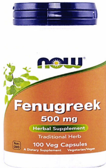
Figure 1. Unregistered NOW Fenugreek, 500mg, Herbal Supplement, Traditional Herb, Vegetarian Capsules

The Food and Drug Administration (FDA) warns the public from purchasing and consuming the following unregistered food supplements: