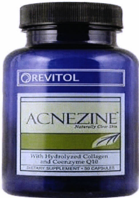
Figure 2. Unregistered REVITOL ACNEZINE Naturally Clear Skin with Hydrolyzed Collagen and Coenzyme Q10, Dietary Supplement, 30 Capsules