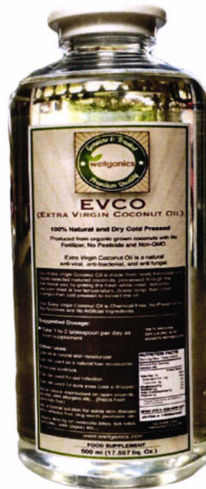
Figure 5. Unregistered WELLGANICS “Live Well, Live Free” Extra Virgin Coconut Oil, 500ml