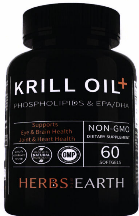
Figure 5. Unregistered Krill Oil+ Phospholipids & EPA/DHA, Non-GMO Dietary Supplement, 60 Softgels