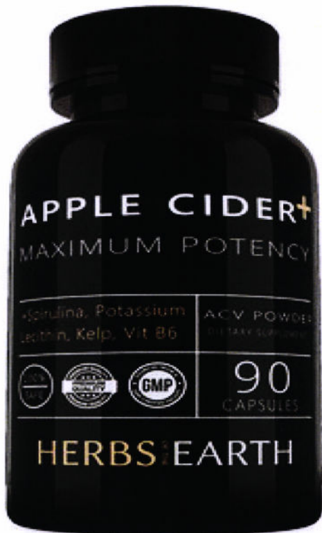
Figure 2. Unregistered HERBS OF THE EARTH Apple Cider+ Maximum Potency, Spirulina, Potassium, Lecithin, Kelp, Vit B6, 90 Capsules