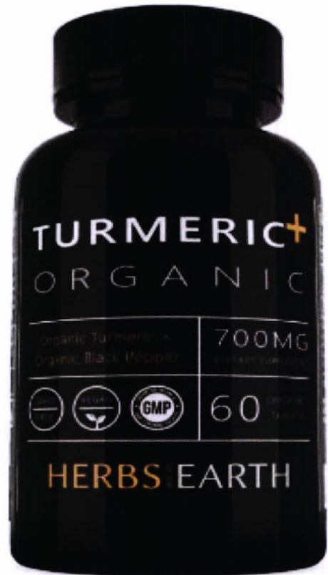
Figure 3. Unregistered HERBS OF THE EARTH Turmeric+ Organic + Organic Black Pepper, Dietary Supplement, 700mg, 60 Organic Tablets