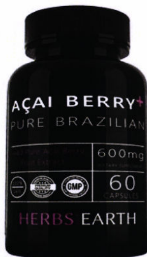
Figure 1. Unregistered HERBS OF THE EARTH Acai Berry+ Pure Brazillian Acai, Dietary Supplement, 600mg, 60 Capsules

The Food and Drug Administration (FDA) warns the public from purchasing and consuming the following unregistered food supplements: