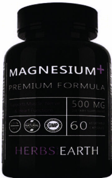
Figure 4. Unregistered HERBS OF THE EARTH Magnesium+ Premium Formula, 500mg, 60 Vegetable Capsules