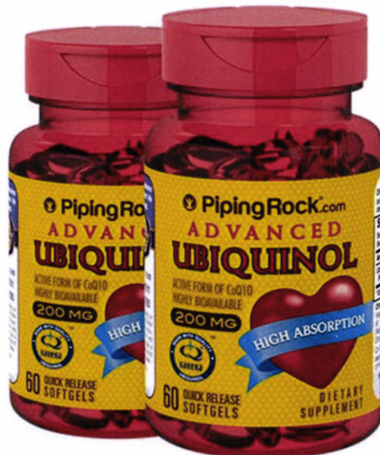
Figure 1. Unregistered PIPING ROCK Advanced Ubiquinol Active Form of CoQ10 Highly Bioavailable 100mg Dietary Supplement Softgels

The Food and Drug Administration (FDA) advises the public from purchasing and consuming the following unregistered food supplements and food products: