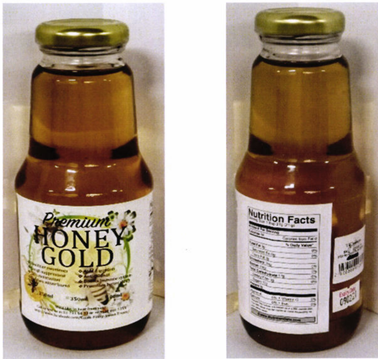
Figure 4. Unregistered PREMIUM Honey Gold

The FDA verified through post-marketing surveillance that the abovementioned food supplements and food products are not authorized and the Certificates of Product Registration (CPR) have not been issued. Pursuant to the Republic Act No. 9711, otherwise known as the “Food and Drug Administration Act of 2009”, the manufacture, importation, exportation, sale, offering for sale, distribution, transfer, non-consumer use, promotion, advertising or sponsorship of health products without the proper authorization is prohibited.