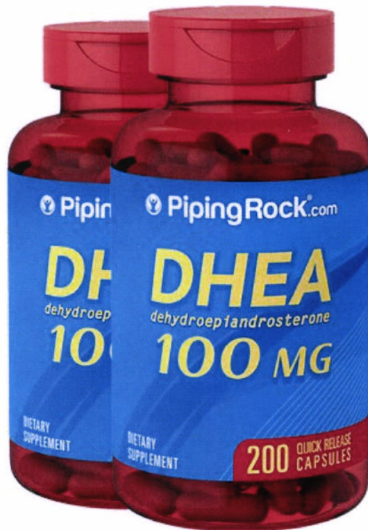
Figure 2. Unregistered PIPING ROCK DHEA Dehydroepiandrosterone 100mg Dietary Supplement Capsules