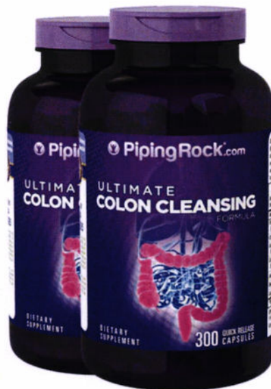
Figure 1. Unregistered PIPING ROCK Ultimate Colon Cleansing Formula Dietary Supplement Capsule

The Food and Drug Administration (FDA) advises the public from purchasing and consuming the following unregistered food supplements: