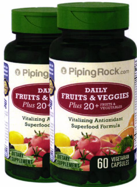
Figure 3. Unregistered PIPING ROCK Daily Fruits & Veggies Plus 20+ Fruits & Vegetables Vitalizing Antioxidant Superfood Formula Dietary Supplement Capsule