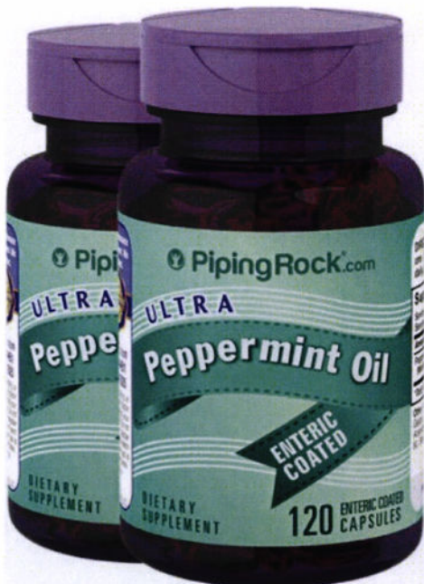
Figure 4. PIPING ROCK Ultra Peppermint Oil Dietary Supplement Capsules