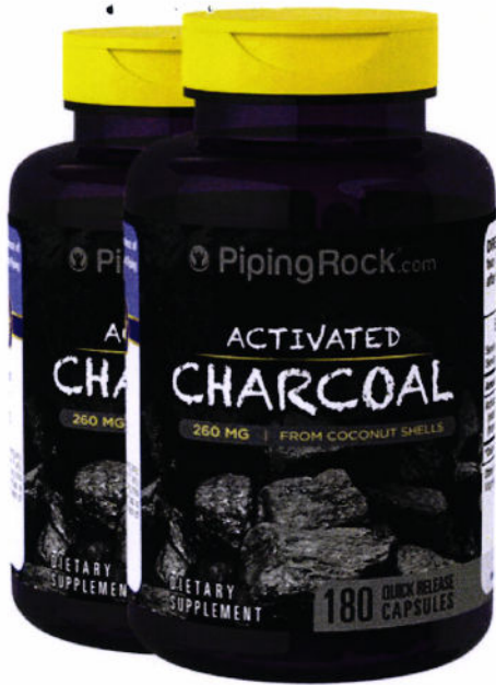
Figure 2. Unregistered PIPING ROCK Activated Charcoal 260mg Natural Vegetable Origin Dietary Supplement Capsule