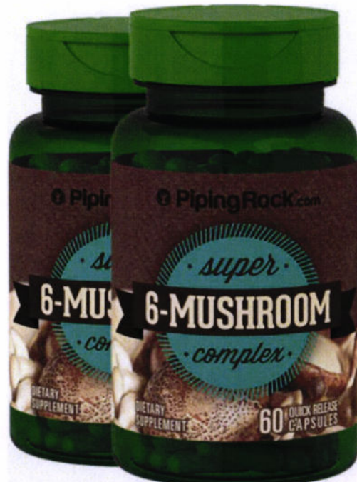
Figure 5. Unregistered PIPING ROCK Super 6-Mushroom Complex Dietary Supplement Capsules