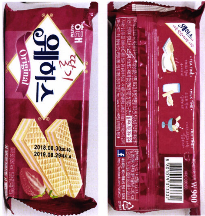
Figure 2. Unregistered HAITAI Original Strawberry Crackers