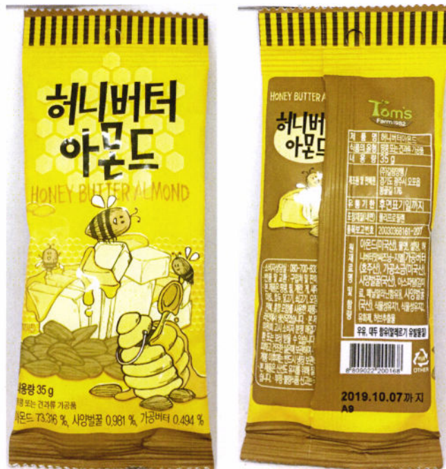
Figure 3. Unregistered TOM'S FARM Honey Butter Almond