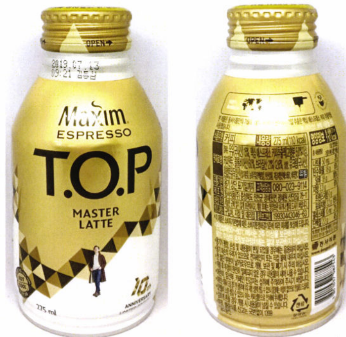
Figure 1. Unregistered MAXIM Espresso T.O.P Master Latte

The Food and Drug Administration (FDA) warns the public from purchasing and consuming the following unregistered food products: