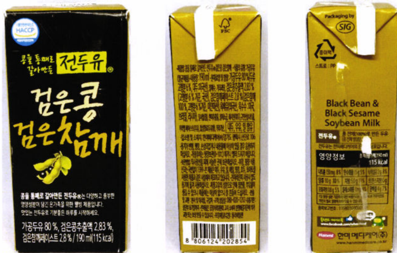
Figure 4. Unregistered HANMI Black Bean & Black Sesame Soybean Milk