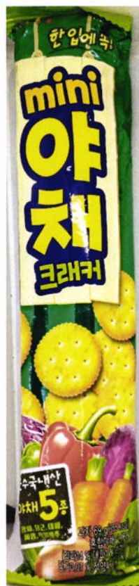
Figure 5. Unregistered LOTTE MINI Vegetable Crackers

The FDA verified through post-marketing surveillance that the abovementioned food products are not authorized and the Certificates of Product Registration have not been issued. Pursuant to the Republic Act No. 9711, otherwise known as the “Food and Drug Administration Act of 2009”, the manufacture, importation, exportation, sale, offering for sale, distribution, transfer, non-consumer use, promotion, advertising or sponsorship of health products without the proper authorization is prohibited.