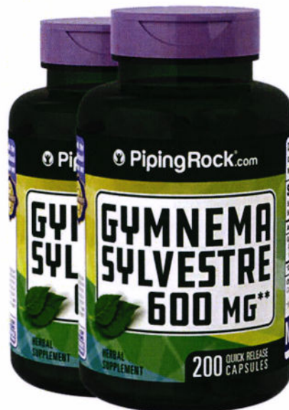
Figure 1. Unregistered PIPING ROCK Gymnema Sylvestre 600mg Dietary Supplement Capsule

The Food and Drug Administration (FDA) advises the public from purchasing and consuming the following unregistered food supplements: