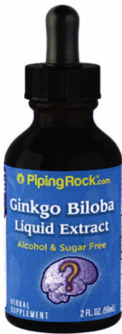
Figure 2. Unregistered PIPING ROCK Ginkgo Biloba Herbal Supplement Liquid Extract