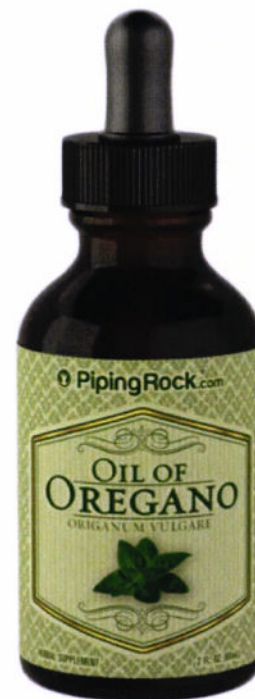
Figure 5. Unregistered PIPING ROCK Oil of Oregano ( Origanum vulgare ) Herbal Supplement Liquid Extract