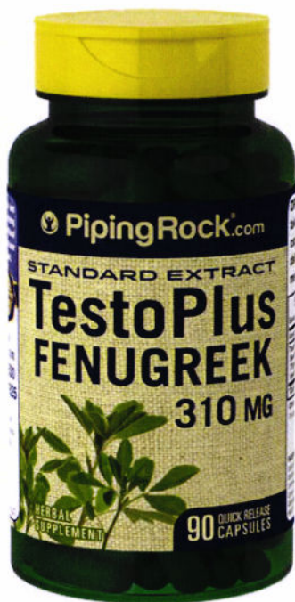
Figure 4. Unregistered PIPING ROCK Standard Extract Testo Plus Fenugreek 310 mg Herbal Supplement Capsules