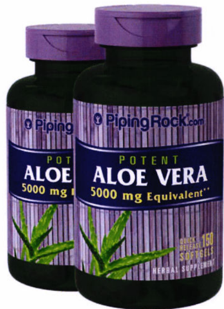
Figure 3. Unregistered PIPING ROCK Potent Aloe Vera 500mg Equivalent Herbal Supplement Softgel