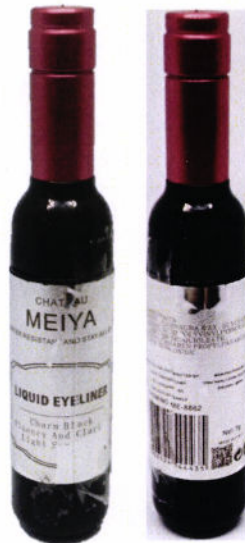
Figure 1. Unnotified Meiya Liquid Eyeliner (ME-8862 Black)

The Food and Drug Administration (FDA) warns the public from purchasing and using the following unnotified cosmetic products: