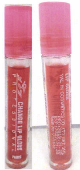
Figure 2. Unnotified A & W Change Lip Gloss Professional

The FDA verified through post-marketing surveillance (PMS) that the abovementioned cosmetic products are not authorized and the Certificates of Product Notification have not been issued. Pursuant to Republic Act No. 9711, otherwise known as the “Food and Drug Administration Act of 2009”, the manufacture, importation, exportation, sale, offering for sale, distribution, transfer, non-consumer use, promotion, advertising or sponsorship of health products without the proper authorization from FDA is prohibited.