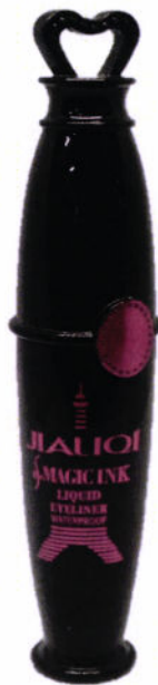
Figure 1. Unnotified Jialiqi Magic Ink Liquid Eyeliner Waterproof

The Food and Drug Administration (FDA) warns the public from purchasing and using the following unnotified cosmetic products: