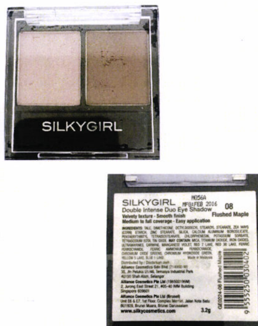
Figure 4. Unnotified Silkygirl Double Intense Duo Eye Shadow 08 Flushed Maple

The FDA verified through post-marketing surveillance (PMS) that the abovementioned cosmetic products are not authorized and the Certificates of Product Notification have not been issued. Pursuant to Republic Act No. 9711, otherwise known as the “Food and Drug Administration Act of 2009”, the manufacture, importation, exportation, sale, offering for sale, distribution, transfer, non-consumer use, promotion, advertising or sponsorship of health products without the proper authorization from FDA is prohibited.