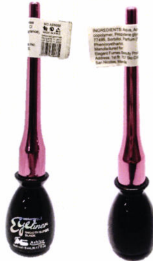
Figure 2. Unnotified AS Ashley Shine Extra Large Wide-Eyed False Lashlook Waterproof Eyeliner