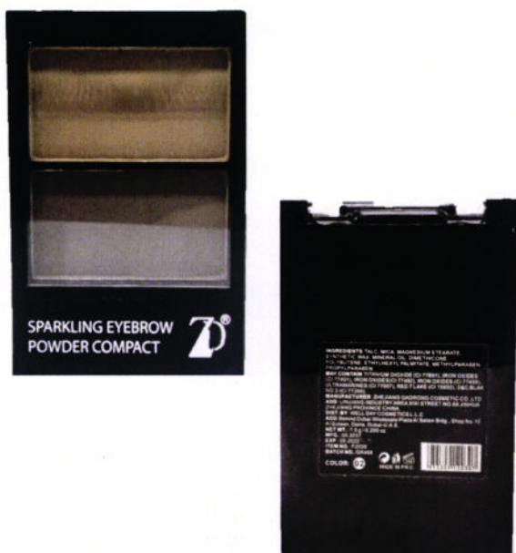
Figure 3. Unnotified ZD® Sparkling Eyebrow Powder Compact (02)