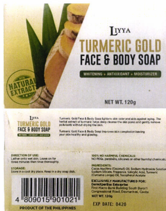
Figure 1. Unnotified Liyya Turmeric Gold Face and Body Soap

The Food and Drug Administration (FDA) warns the public from purchasing and using the following unnotified cosmetic products: