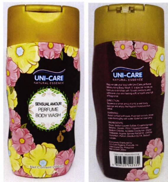
Figure 3. Unnotified Uni-Care Natural Essence Sensual Amour Perfume Body Wash

The FDA verified through post-marketing surveillance (PMS) that the abovementioned cosmetic products are not authorized and the Certificates of Product Notification have not been issued. Pursuant to Republic Act No. 9711, otherwise known as the “Food and Drug Administration Act of 2009”, the manufacture, importation, exportation, sale, offering for sale, distribution, transfer, non-consumer use, promotion, advertising or sponsorship of health products without the proper authorization from FDA is prohibited.