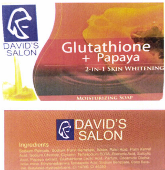
Figure 2. Unnotified David's Salon Glutathione + Papaya 2-in-1 Skin Whitening Moisturizing Soap