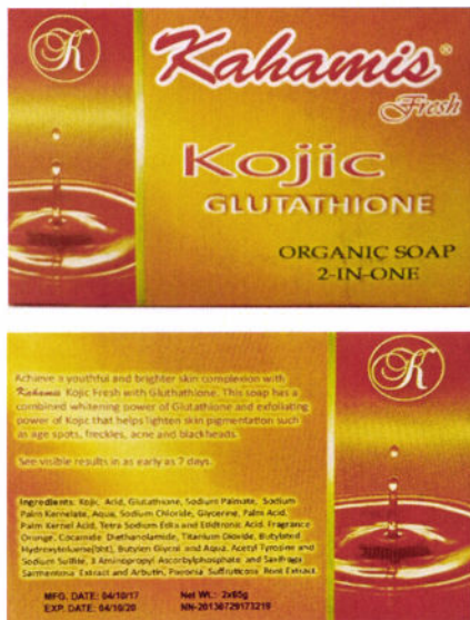
Figure 2. Unnotified Kahamis Fresh Kojic Glutathione Organic Soap