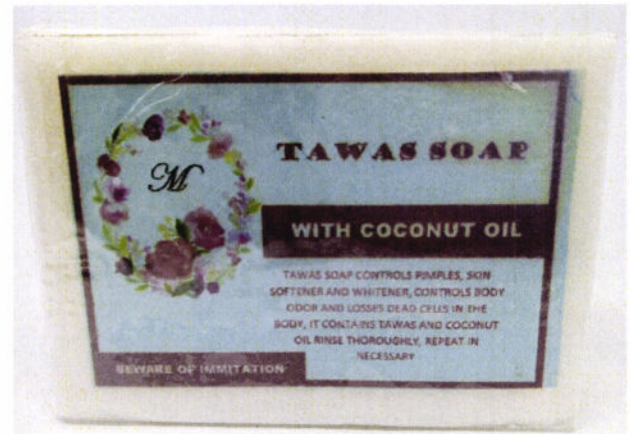
Figure 3. Unnotified M Tawas Soap with Coconut Oil

The FDA verified through post-marketing surveillance (PMS) that the abovementioned cosmetic products are not authorized and the Certificates of Product Notification have not been issued. Pursuant to Republic Act No. 9711, otherwise known as the “Food and Drug Administration Act of 2009”, the manufacture, importation, exportation, sale, offering for sale, distribution, transfer, non-consumer use, promotion, advertising or sponsorship of health products without the proper authorization from FDA is prohibited.