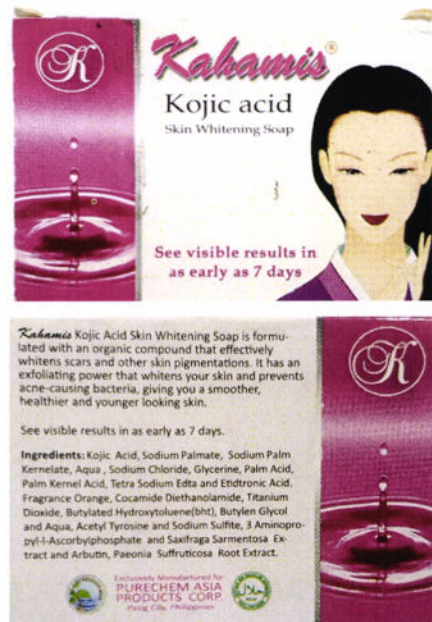
Figure 1. Unnotified Kahamis Kojic Acid Skin Whitening Soap

The Food and Drug Administration (FDA) warns the public from purchasing and using the following unnotified cosmetic products: