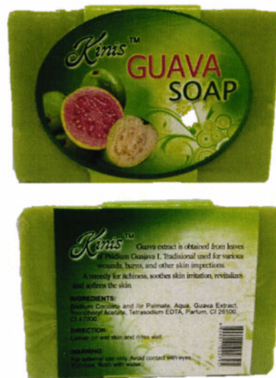
Figure 4. Unnotified Kinis Guava Soap

The FDA verified through post-marketing surveillance (PMS) that the abovementioned cosmetic products are not authorized and the Certificates of Product Notification have not been issued. Pursuant to Republic Act No. 9711, otherwise known as the “Food and Drug Administration Act of 2009”, the manufacture, importation, exportation, sale, offering for sale, distribution, transfer, non-consumer use, promotion, advertising or sponsorship of health products without the proper authorization from FDA is prohibited.