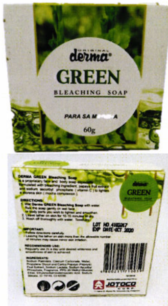
Figure 3. Unnotified Original Derma Green Bleaching Soap