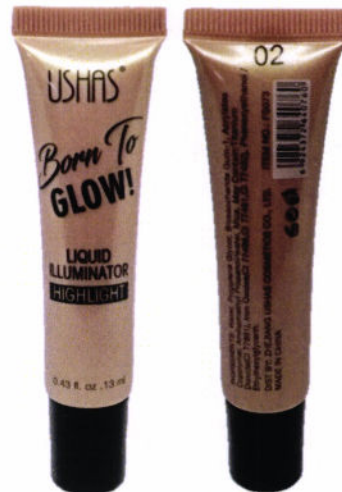
Figure 5. Unnotified Ushas® Born to Glow Liquid Illuminator Highlight (2)