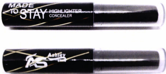
Figure 4. Unnotified AS Ashley Shine Made to Stay Highlighter Concealer (4)