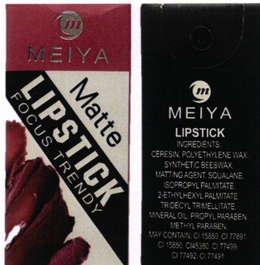
Figure 1. Unnotified Meiya Matte Lipstick Focus Trendy (ME-4559 Cinnamon Spice 03)

The Food and Drug Administration (FDA) warns the public from purchasing and using the following unnotified cosmetic products: