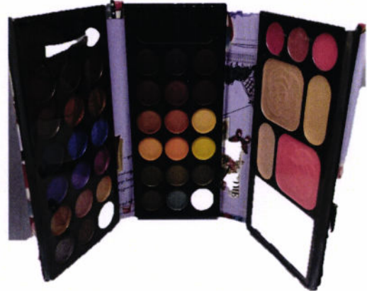
Figure 3. Unnotified Make-Up Palette (Unlabelled)