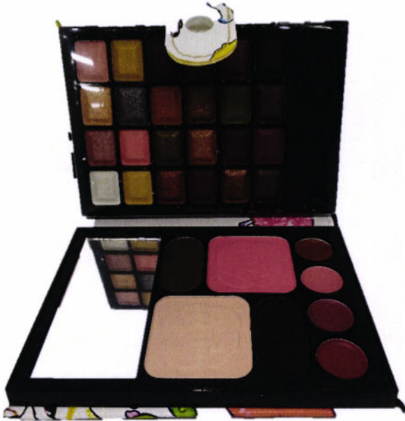
Figure 2. Unnotified Make-Up Palette (Unlabelled)