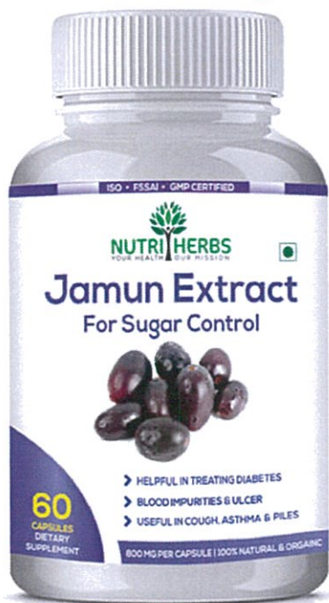
Figure 4. Unregistered NUTRI HERBS Jamun For Sugar Control