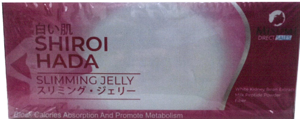
Figure 2. Unregistered SHIROI HADA Slimming Jelly