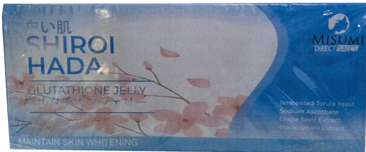
Figure 3. Unregistered SHIROI HADA Glutathione Jelly