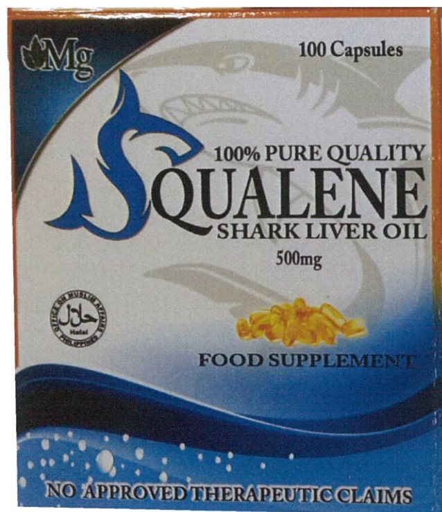
Figure 1. Unregistered MG SQUALENE Shark Liver Oil Food Supplement, 500mg

The Food and Drug Administration (FDA) warns the public from purchasing and consuming the following food supplements: