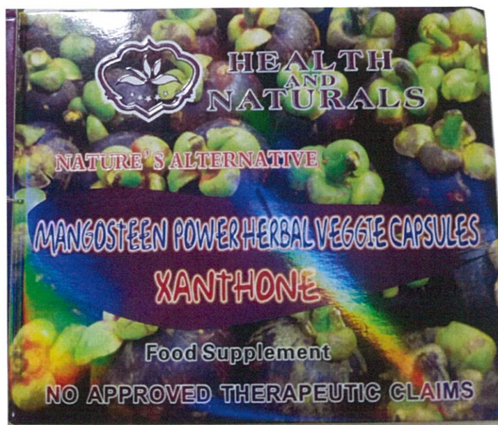
Figure 5. Unregistered HEALTH AND NATURALS Mangosteen Power Herbal Veggie Capsules Xanthone Food Supplement