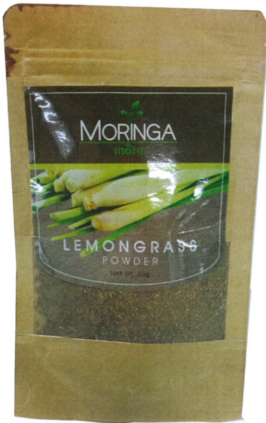
Figure 2. Unregistered MORINGA & MORE Lemongrass Powder, 30g