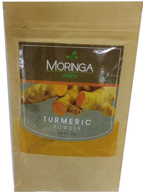
Figure 3. Unregistered MORINGA & MORE Turmeric Powder, 30g