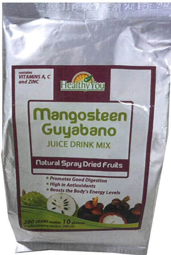
Figure 4. Unregistered HEALTHY YOU Mangosteen Guyabano Juice Drink Mix