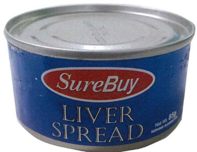
Figure 5. Unregistered SURE BUY Liver Spread