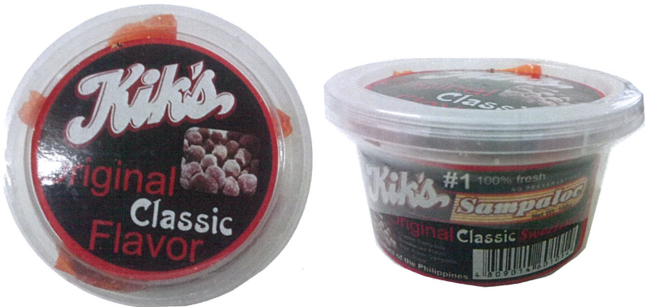
Figure 1. Unregistered KIK'S Sampaloc, Original Classic Flavor

The Food and Drug Administration (FDA) warns the public from purchasing and consuming the following unregistered food products: