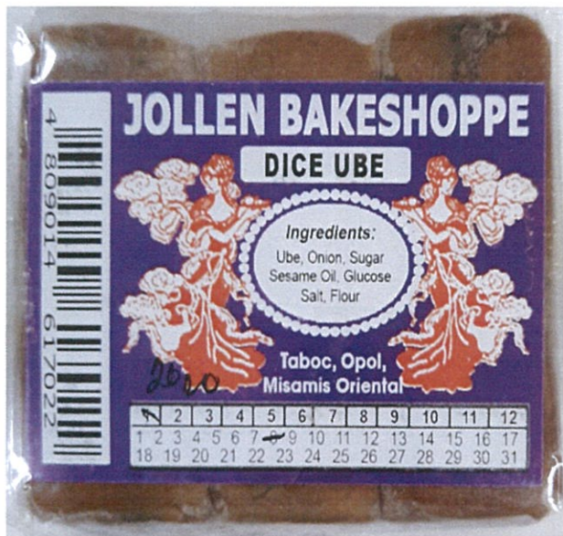
Figure 2. Unregistered JOLLEN BAKESHOPPE Dice Ube