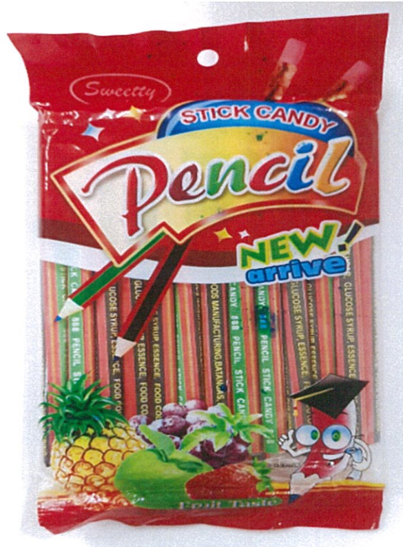
Figure 5. Unregistered SWEETTY Stick Pencil Candy, Net Wt. 24x6g