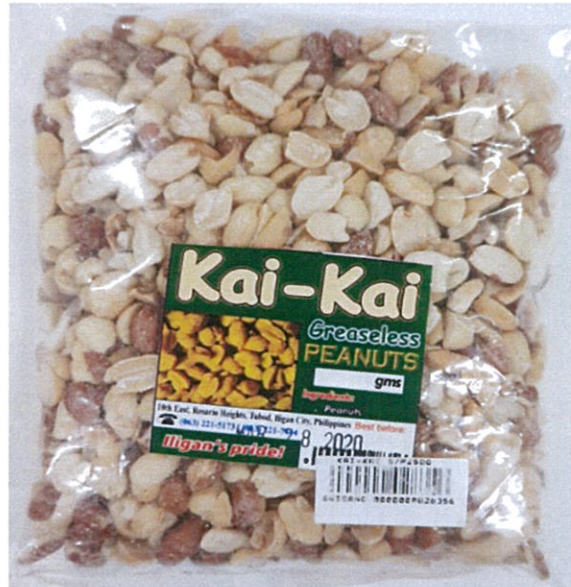
Figure 3. Unregistered KAI-KAI Greaseless Peanuts, Net Wt. 250g