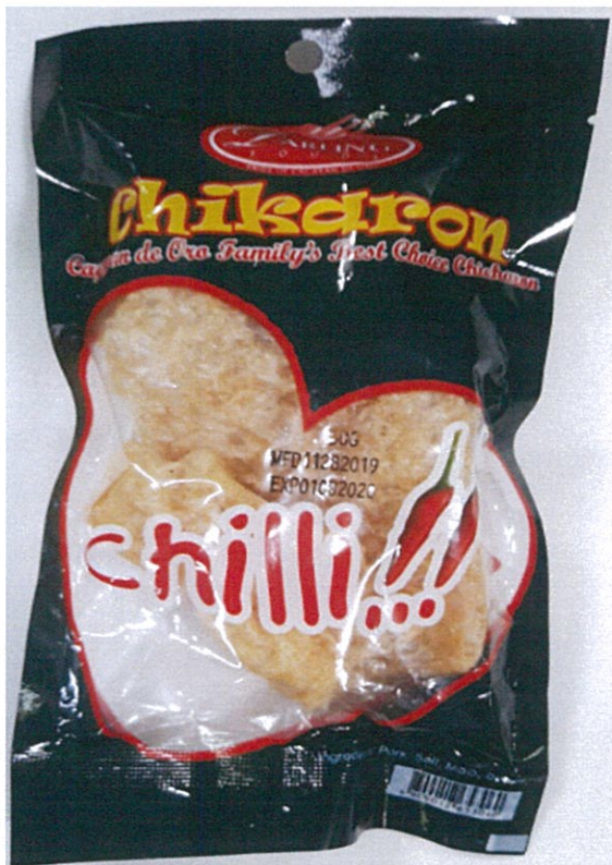
Figure 4. Unregistered DARLING FOODS Chikaron Chilli