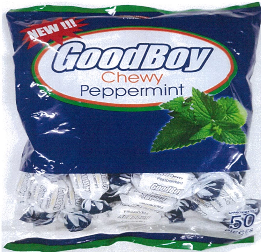
Figure 1. Unregistered GOODBOY Chewy Peppermint, Approximately 50 pieces

The Food and Drug Administration (FDA) warns the public from purchasing and consuming the following unregistered food products: