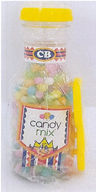
Figure 2. Unregistered CB Candy Mix®