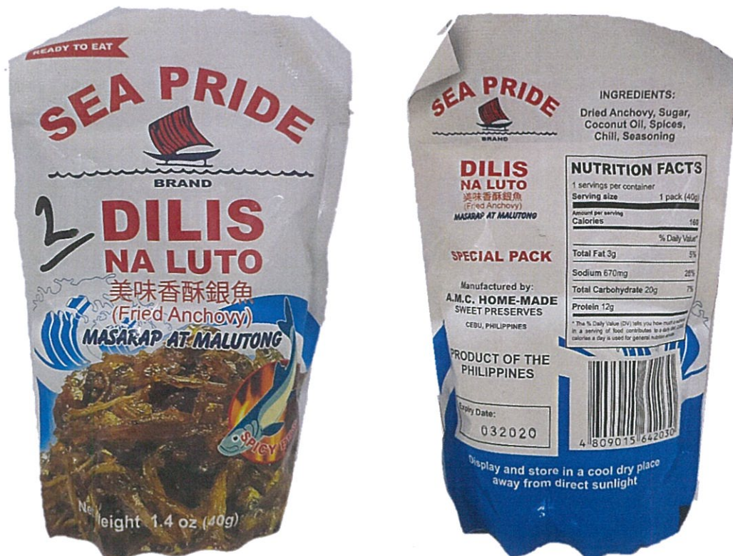
Figure 1. Unregistered SEA PRIDE BRAND Dilis na Luto (Fried Anchovy) Masarap at Malutong

The Food and Drug Administration (FDA) warns the public from purchasing and consumption of the following unregistered food products: