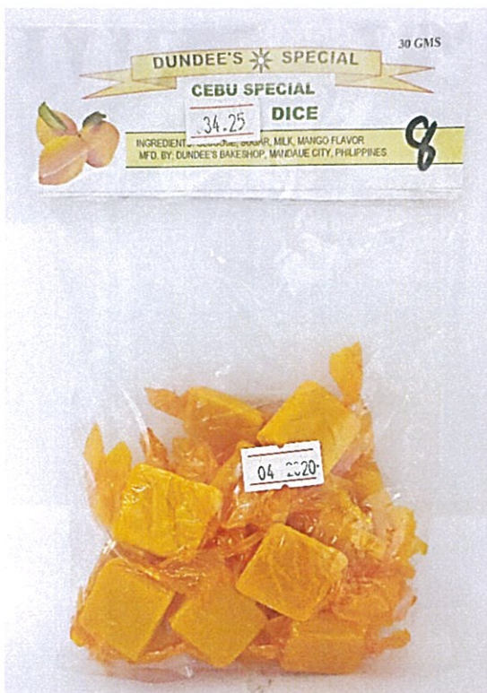
Figure 4. Unregistered DUNDEE'S SPECIAL Cebu Special Mango Dice