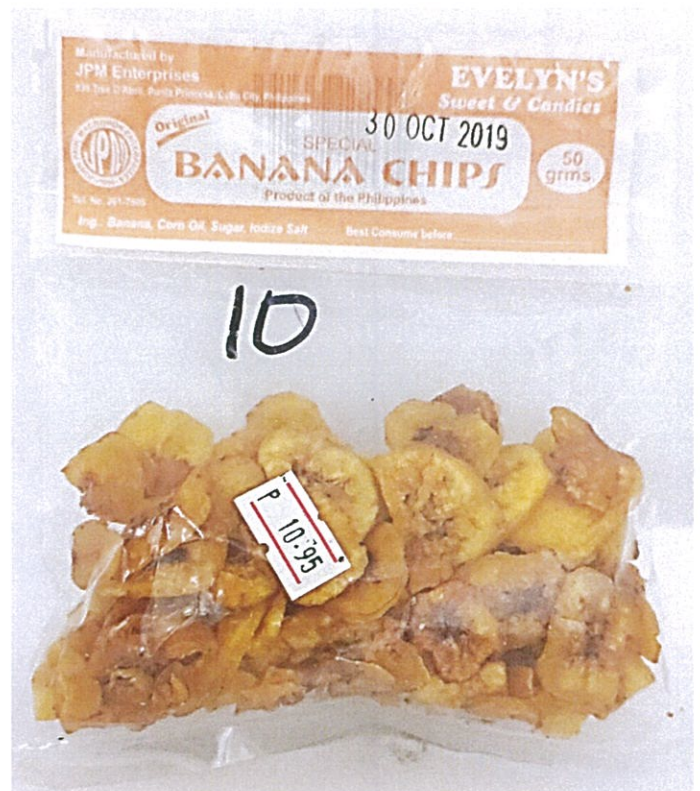
Figure 5. Unregistered EVELYN'S Sweet & Candies Special Banana Chips