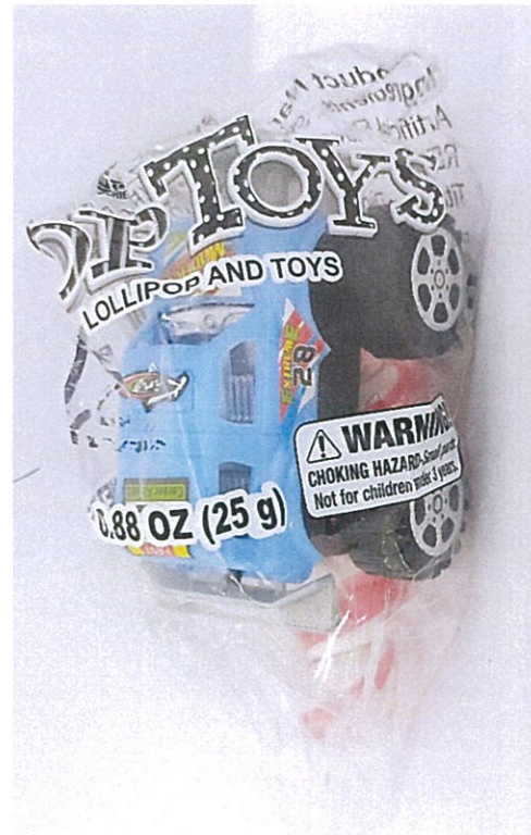
Figure 3. Unregistered POP TOYS Lollipop and Toys Swirly Pop