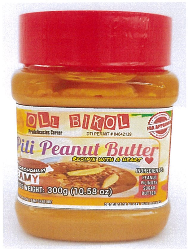
Figure 3. Unregistered OLL BIKOL Pili Peanut Butter Recipe with a Heart