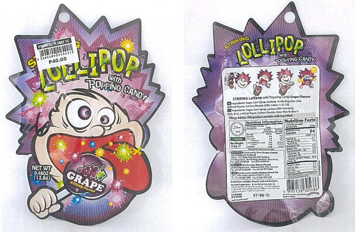
Figure 1. Unregistered STRIKING Lollipop with Candy (Grape)

The Food and Drug Administration (FDA) warns the public from purchasing and consumption of the following unregistered food products: