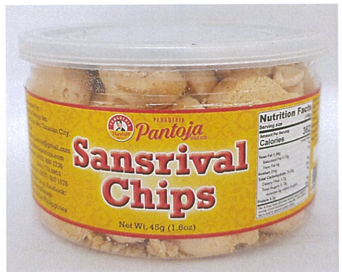
Figure 5. Unregistered PANADERIA PANTOJA Sansrival Chips