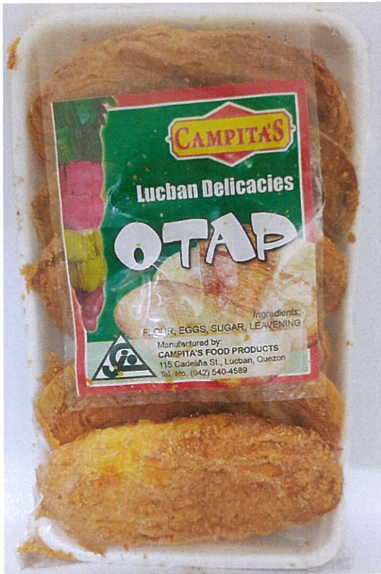
Figure 2. Unregistered CAMPITA'S Lucban Delicacies Otap