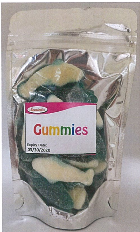
Figure 4. Unregistered SARMIENTO Gummies