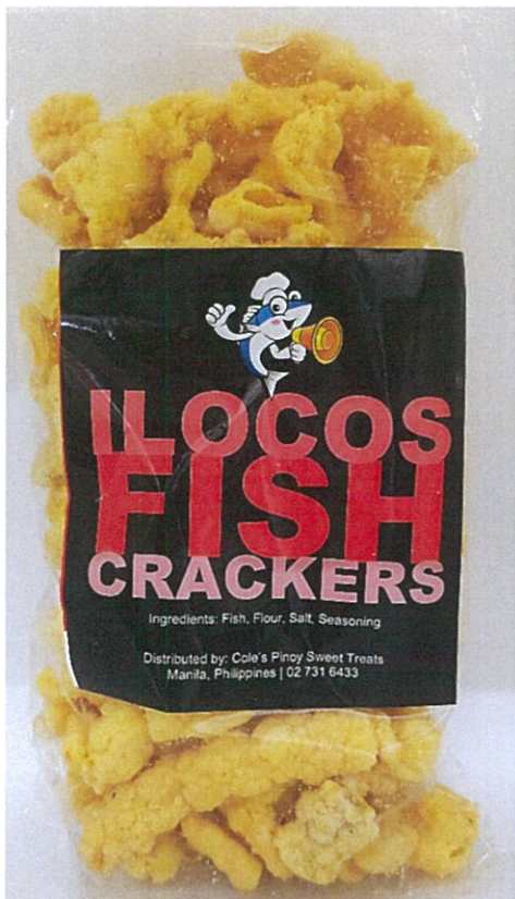
Figure 4. Unregistered ILOCOS Fish Crackers