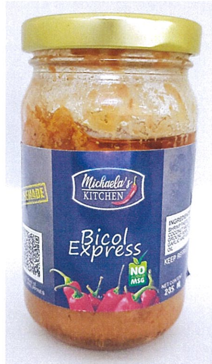
Figure 3. Unregistered MICHAELA'S KITCHEN Bicol Express