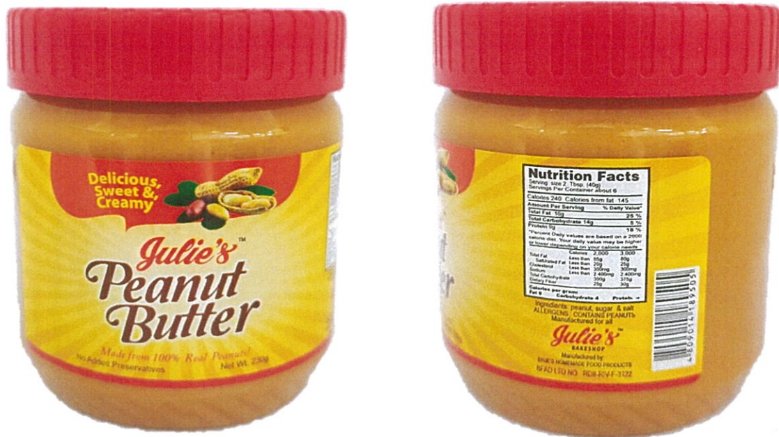
Figure 1. Unregistered JULIE'S™ Delicious, Sweet &, Creamy Peanut Butter

The Food and Drug Administration (FDA) warns the public from purchasing and consumption of the following unregistered food products and food supplement: