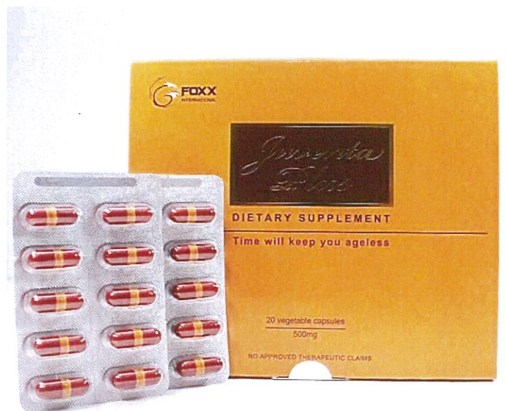
Figure 5. Unregistered GFOXX JUVENTA PLUS Dietary Supplement