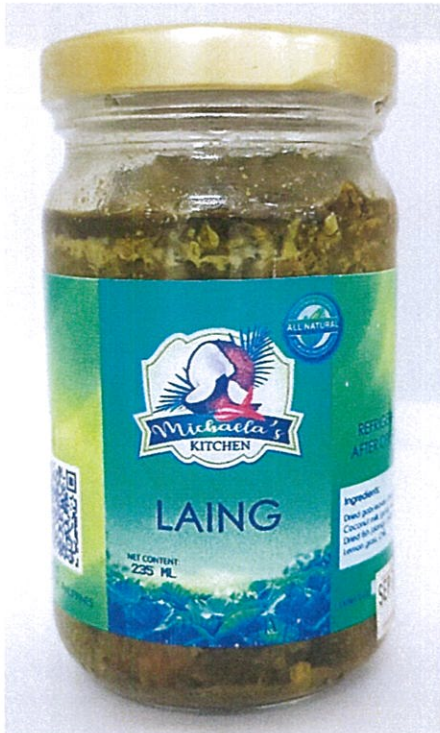
Figure 2. Unregistered MICHAELA'S KITCHEN Laing