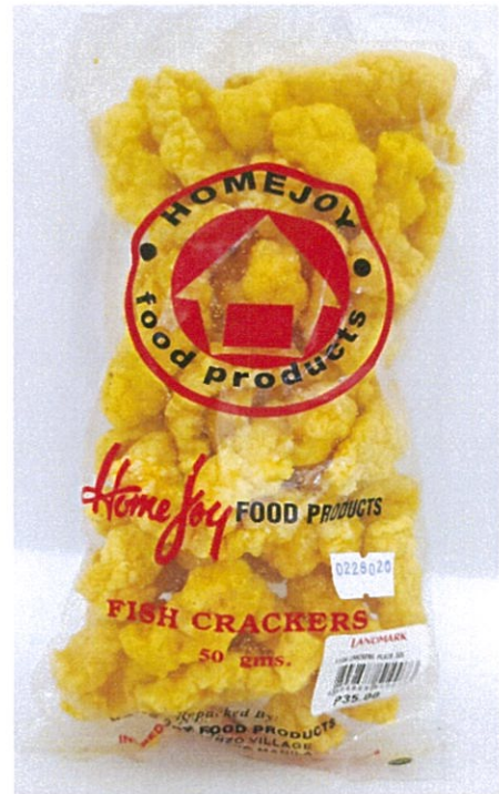
Figure 3. Unregistered HOMEJOY FOOD PRODUCTS Fish Crackers