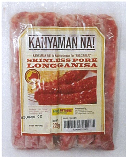
Figure 4. Unregistered KANYAMAN NA! Skinless Pork Longganisa