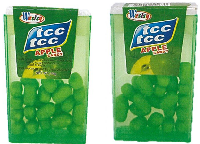
Figure 5. Unregistered WESLSY TCC TCC Apple Candy