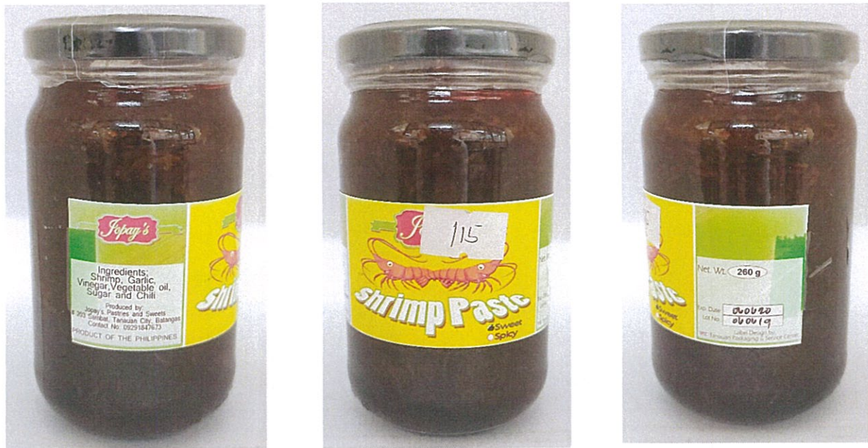
Figure 1. Unregistered JOPAY'S Sweet Shrimp Paste

The Food and Drug Administration (FDA) warns the public from purchasing and consumption of the following unregistered food products: