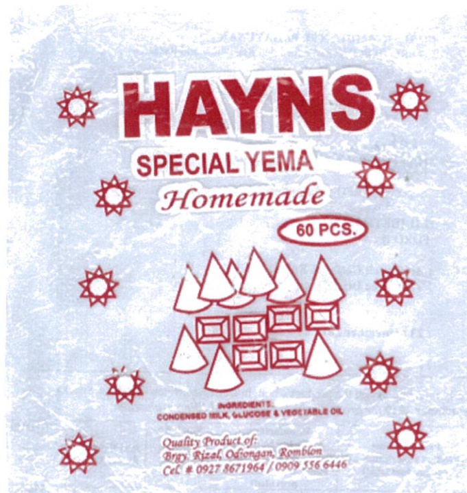
Figure 1. Unregistered HAYNS Special Yema, Homemade

The Food and Drug Administration (FDA) warns the public from purchasing and consuming the following unregistered food products: