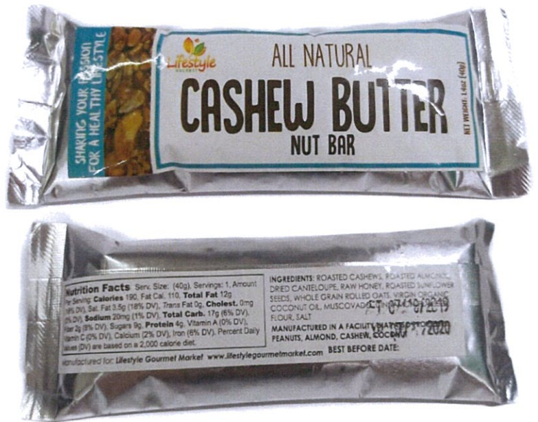
Figure 3. Unregistered LIFESTYLE GOURMET All Natural Cashew Butter, Nut