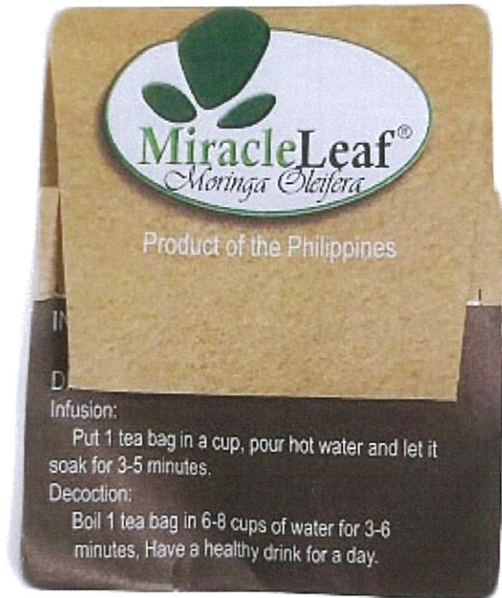
Figure 4. Unregistered MIRACLE LEAF Moringa Oleifera, Pure Moringa Oleifera Tea