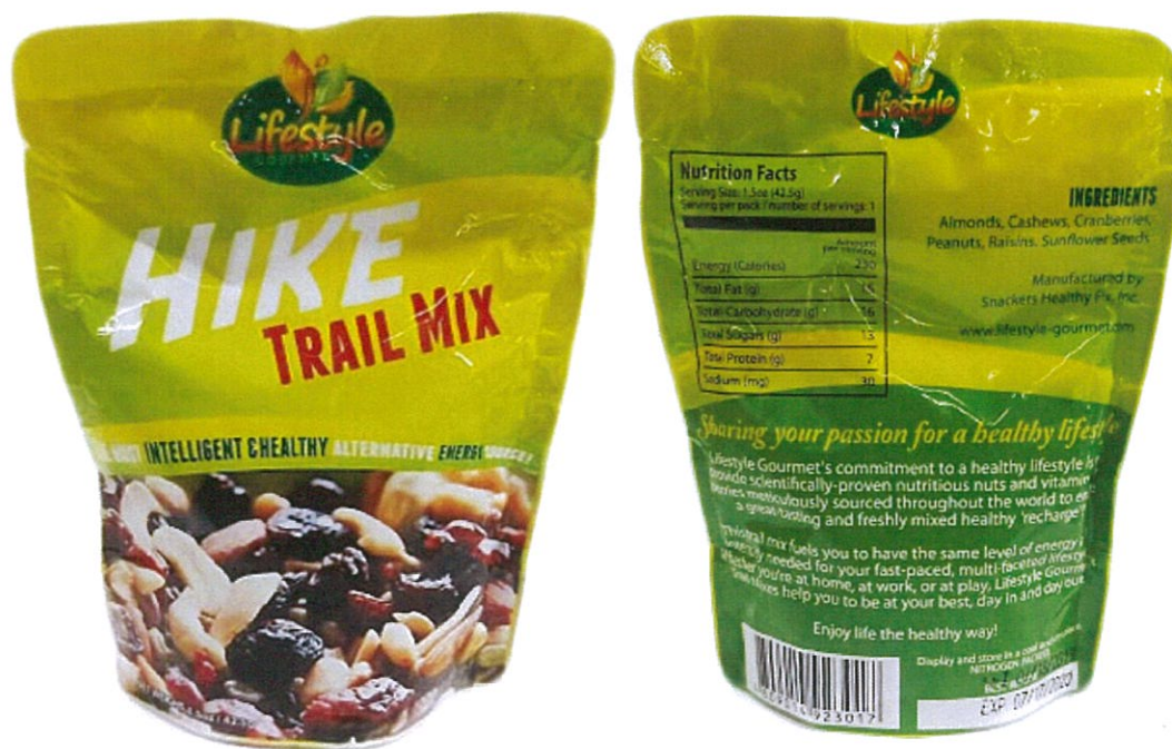
Figure 5. Unregistered LIFESTYLE GOURMET Hike Trail Mix

The FDA verified through post-marketing surveillance that the above mentioned food products are not authorized and the Certificates of Product Registration have not been issued. Pursuant to the Republic Act No. 9711, otherwise known as the “Food and Drug Administration Act of 2009”, the manufacture, importation, exportation, sale, offering for sale, distribution, transfer, non-consumer use, promotion, advertising or sponsorship of health products without the proper authorization is prohibited.