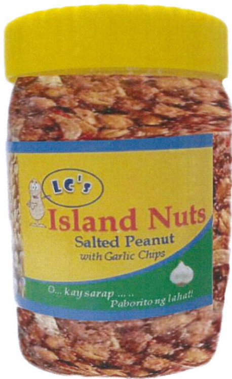
Figure 2. Unregistered LC'S Island Nuts, Salted Peanut with Garlic Chips