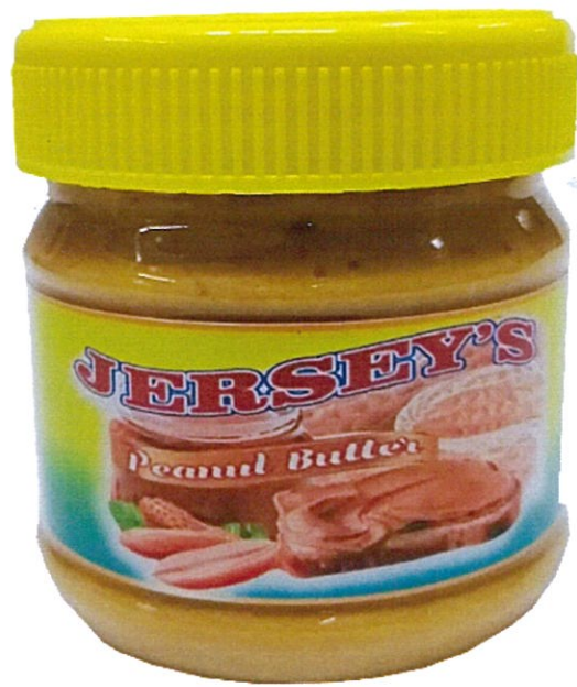
Figure 3. Unregistered JERSEY'S Peanut Butter (200 grams)