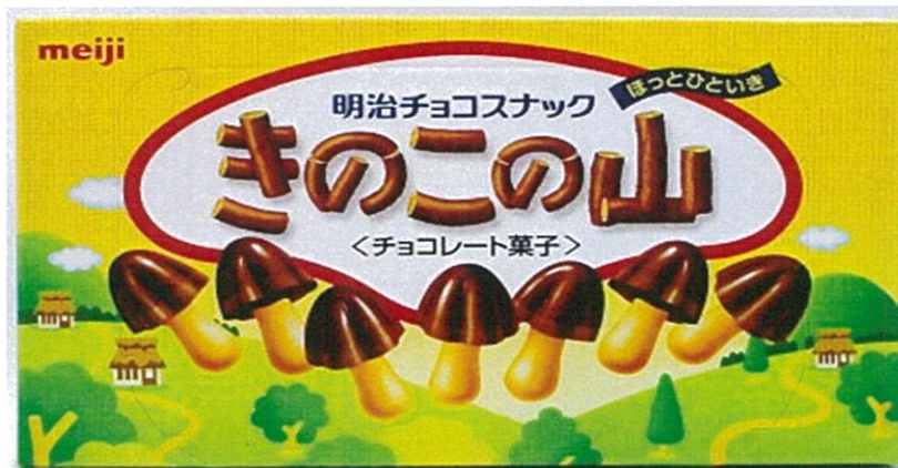
Figure 4. Unregistered MEIJI Chocolate (labels are in foreign characters)