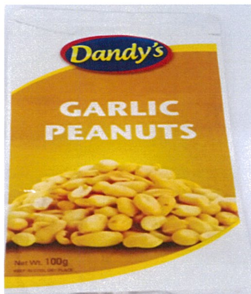
Figure 5. Unregistered DANDY'S Garlic Peanuts (100 grams)