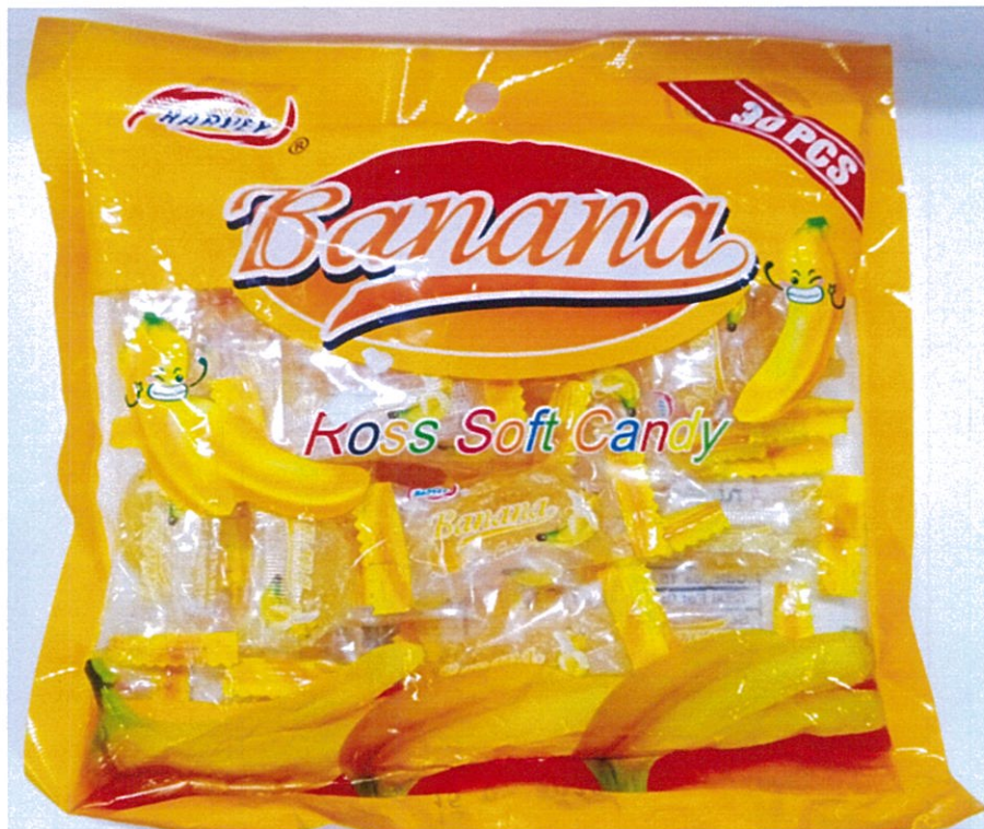
Figure 1. Unregistered HARVEY® Banana Ross Soft Candy (30 pieces)

The Food and Drug Administration (FDA) warns the public from purchasing and consuming the following unregistered food products: