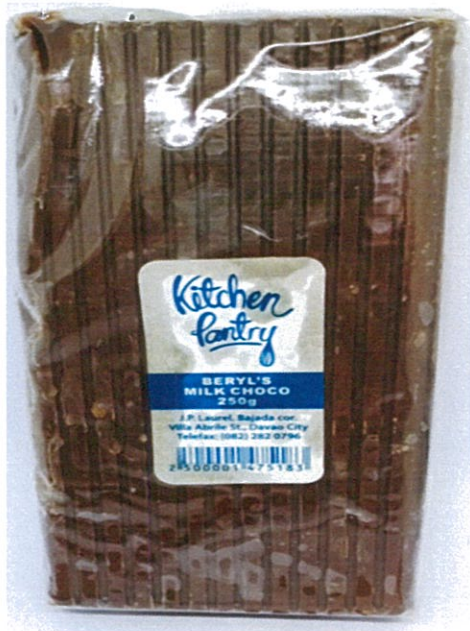
Figure 2. Unregistered KITCHEN PANTRY BERYL'S Milk Choco (250 grams)