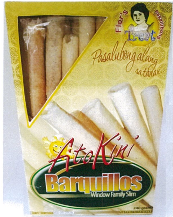
Figure 3. Unregistered FLOR'S PASALUBONG TREAT ATO KINI Barquillos Window Family Slim 240 grams)