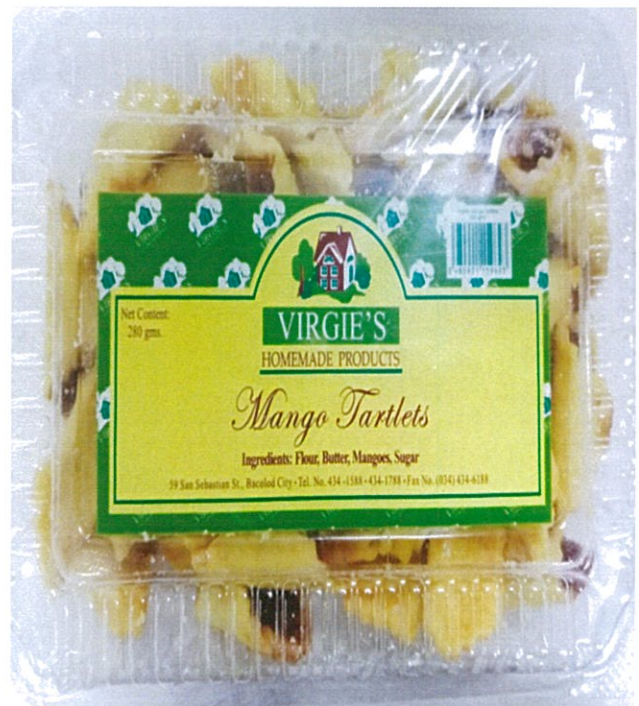
Figure 5. Unregistered VIRGIE'S HOMEMADE PRODUCTS Mango Tartlets (280 grams)