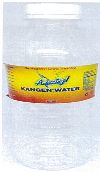
Figure 1. Unregistered AMAZING! KANGEN Water (350 mL)

The Food and Drug Administration (FDA) warns the public from purchasing and consuming the following unregistered food products: