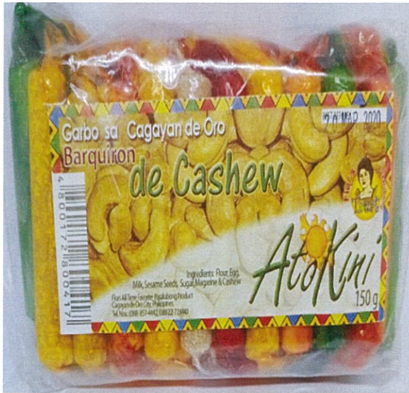
Figure 2. Unregistered FLOR'S PASALUBONG TREAT ATO KINI Barquiron de Cashew (150 grams)