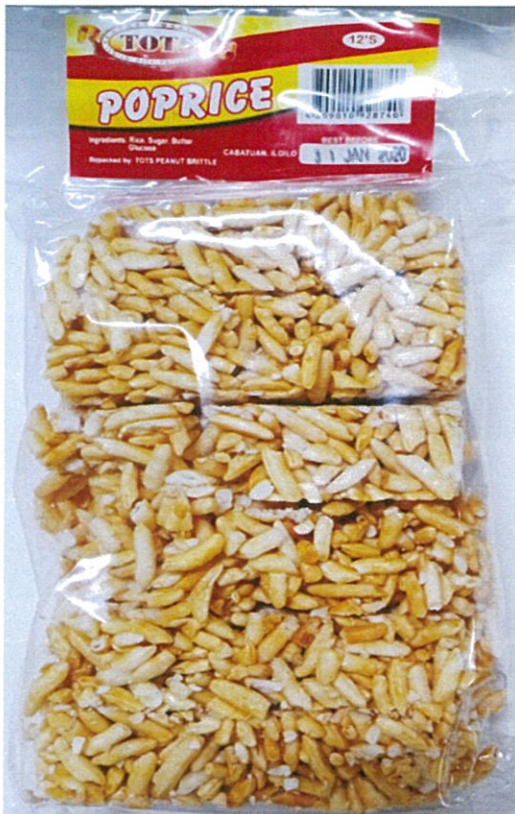
Figure 4. Unregistered TOTS Poprice (12's)