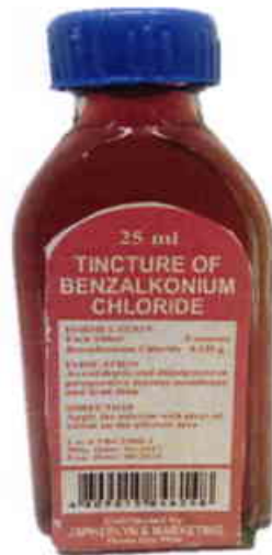
TINCTURE OF BENZALKONIUM CHLORIDE 25ml Distributed by: JSPHERLYN'S MARKETING – Davao City