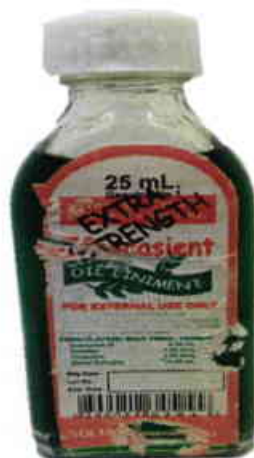
EXTRA STRENGTH METHYL SALICYLATE CAMPHOR + MENTHOL (Efficasient) OIL LINIMENT 25mL Distributed by: SOLTAN MARKETING – Davao City, Philippines