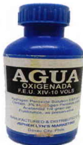
AGUA OXIGENADA F.E.U. XIV-10 VOLS 60ML Manufactured and Distributed by: JSPHERLYN'S MARKETING – Davao City