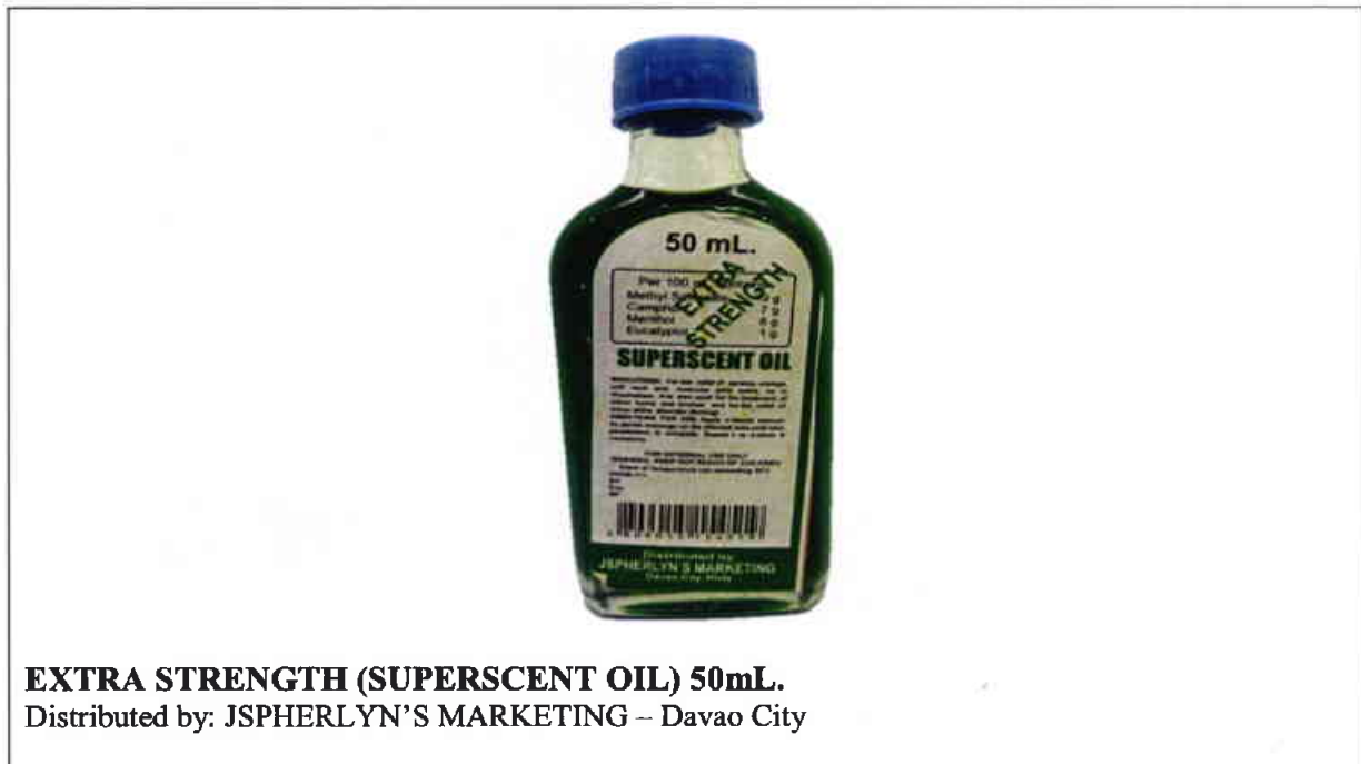
Figure 10. Unregistered drug product