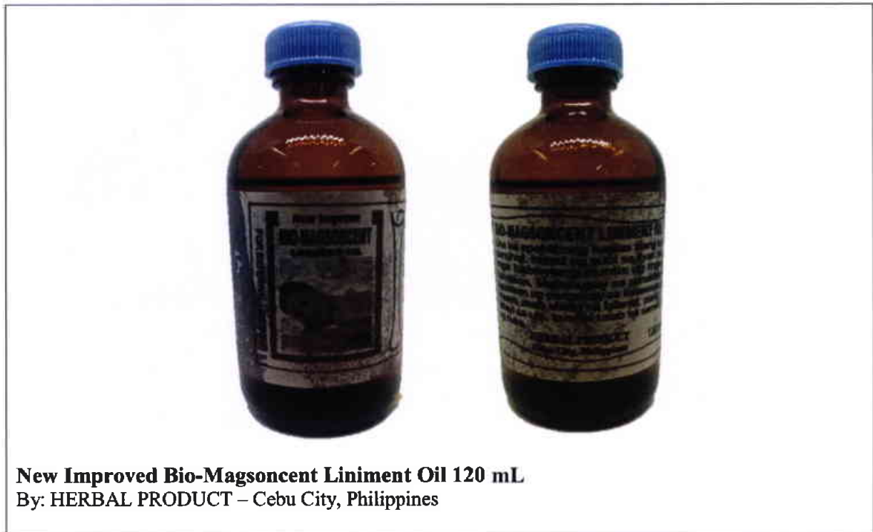
Figure 7. Unregistered drug product