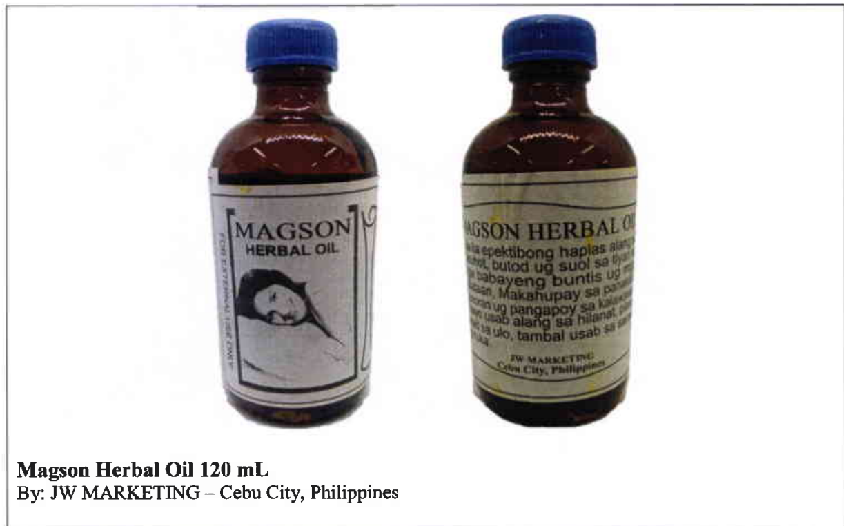
Figure 8. Unregistered drug product