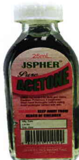
JSPHER™ PURE ACETONE 25mL. Manufactured & Distributed by: JSPHERLYN'S MARKETING – Davao City, Phils.