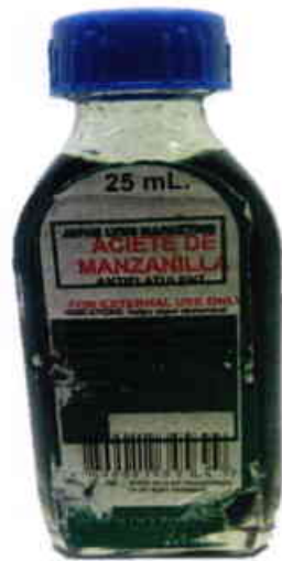
JSPHER LYN'S MARKETING ACIETE DE MANZANILLA 25mL. Distributed by: JSPHERLYN'S MARKETING – Davao City