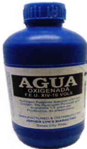
AGUA OXIGENADA F.E.U. XIV-10 VOLS 120ML Manufactured and Distributed by: JSPHERLYN'S MARKETING – Davao City

The Food and Drug Administration (FDA) advises the public against the purchase and use of the following unregistered drug products: