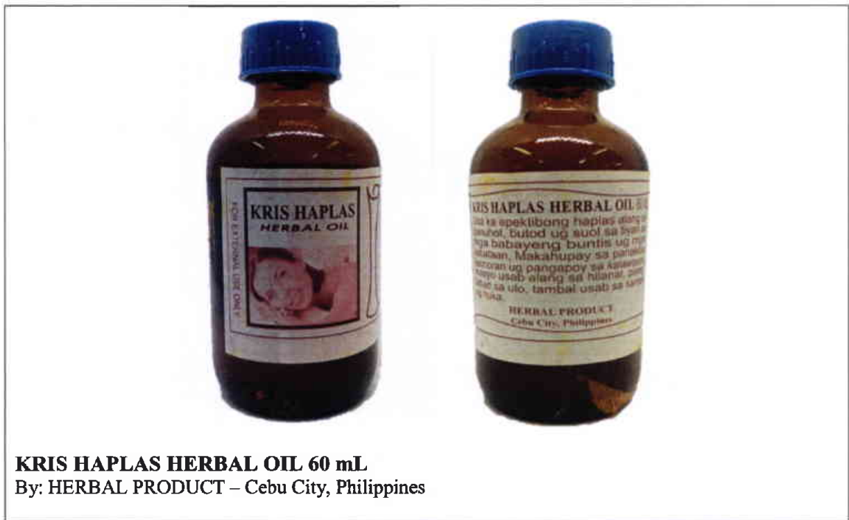
Figure 9. Unregistered Drug Product