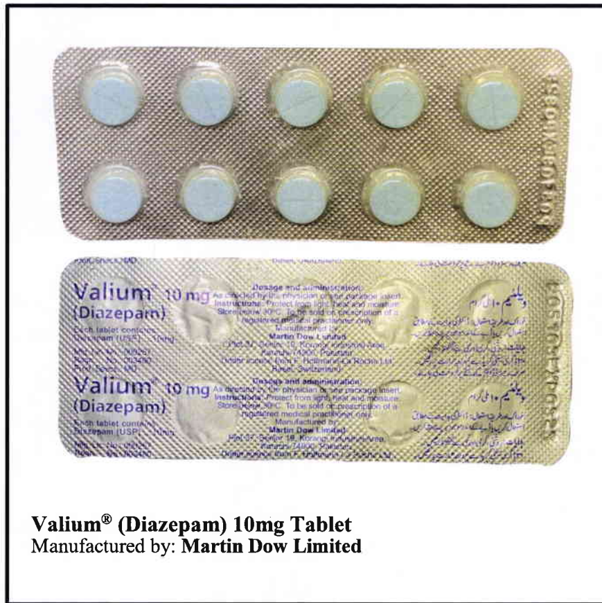
Valium® (Diazepam) 10mg Tablet Manufactured by: Martin Dow Limited