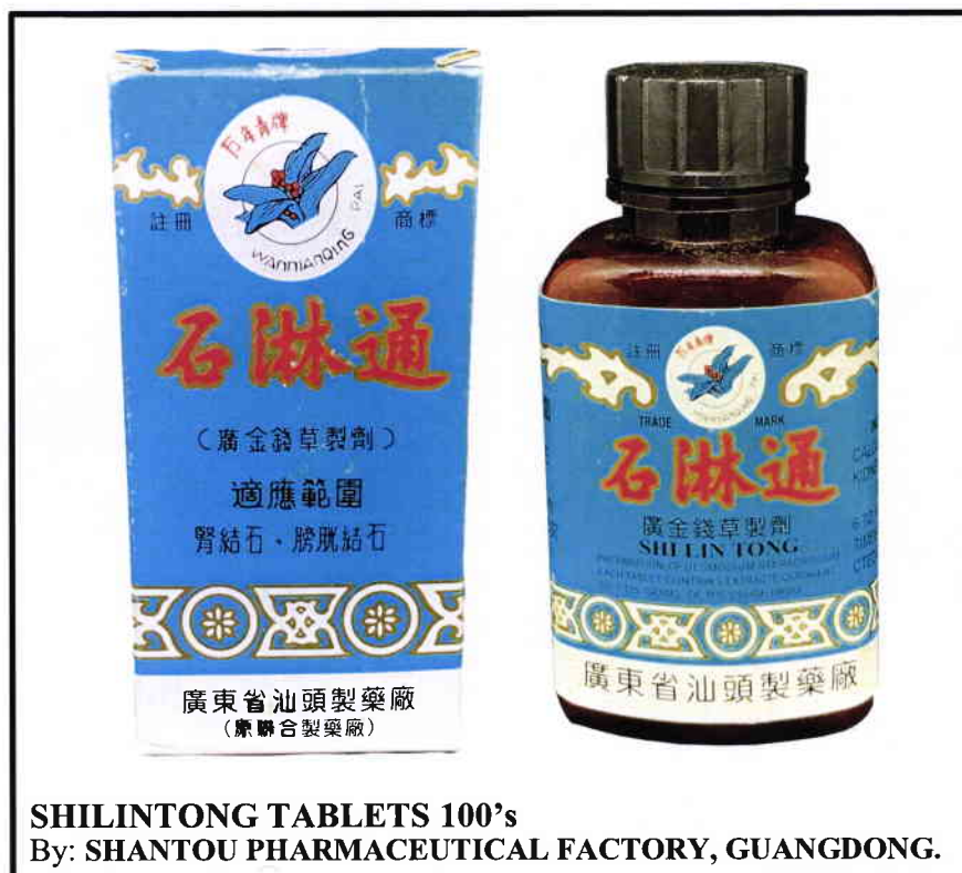
Figure 3. Unregistered drug product