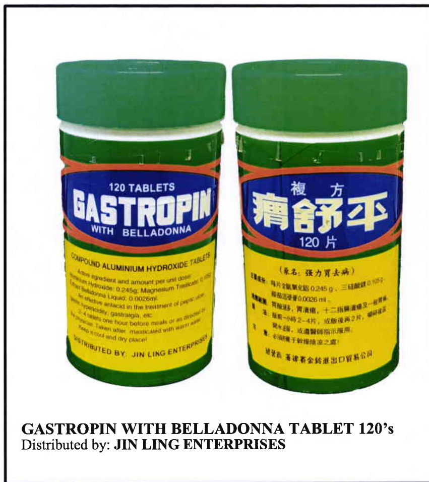
GASTROPIN WITH BELLADONNA TABLET 120's Distributed by: JIN LING ENTERPRISES

The Food and Drug Administration (FDA) advises the public against the purchase and use of the following unregistered drug products: